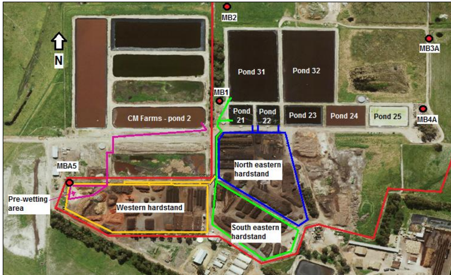
Figure 2: Premises layout

The Premises layout, approximate location of drainage channels and monitoring bores are shown in the map below.