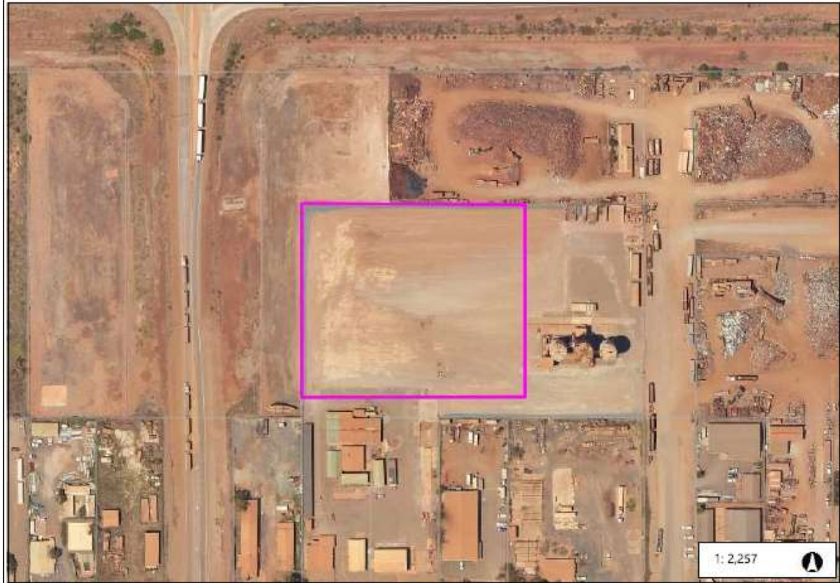
Figure 1: Map of the boundary of the prescribed premises

The boundary of the prescribed premises is shown in the map below (Figure 1).