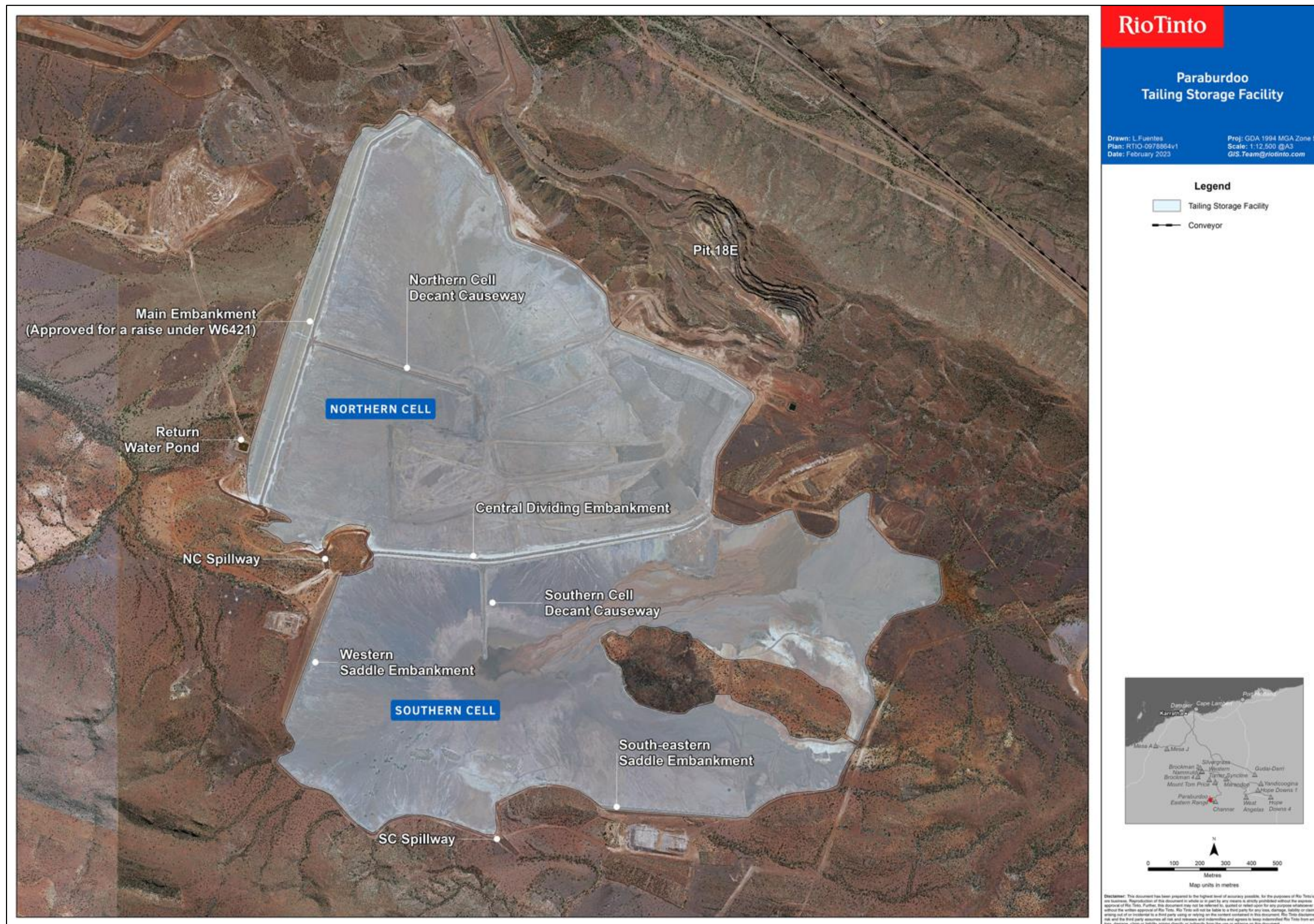
Figure 6: Map of the Paraburdoo Tailings Storage Facility