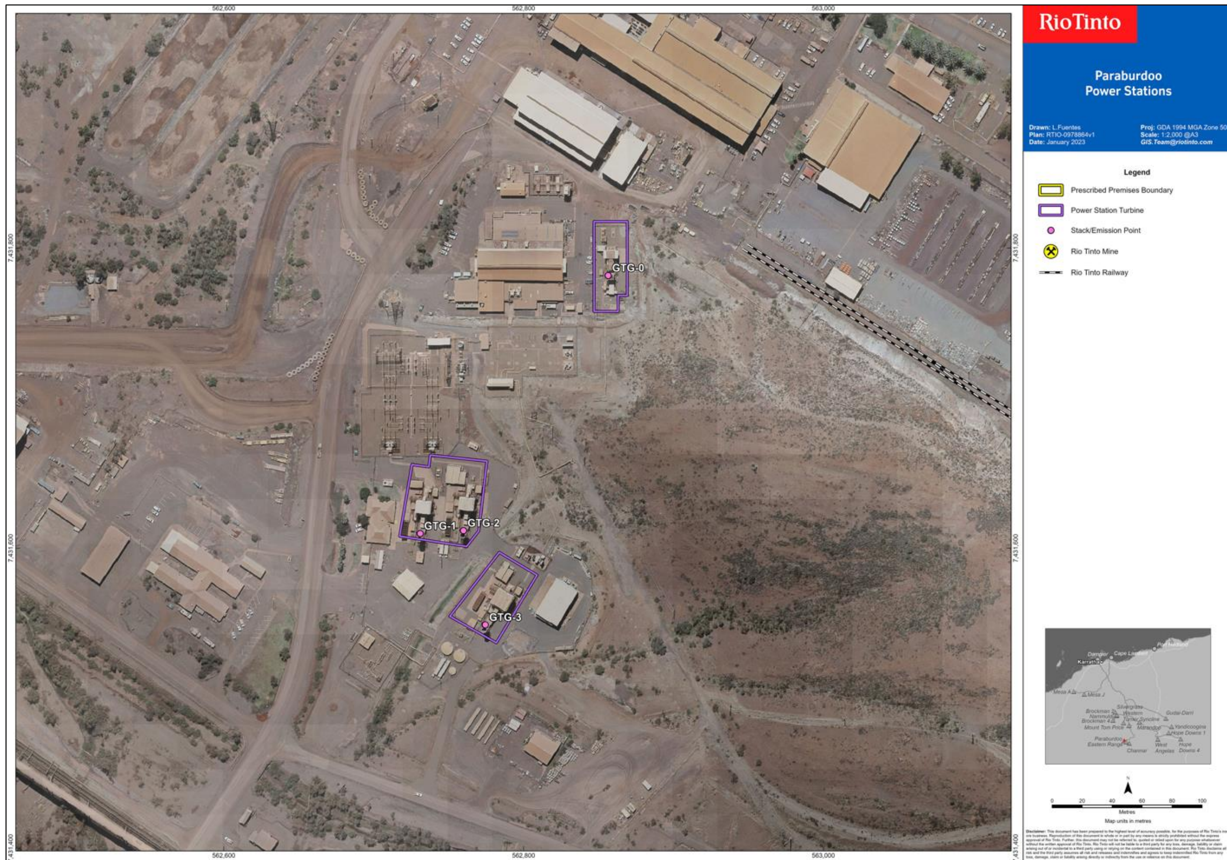
Figure 5: Map of the power station and stack/emission points