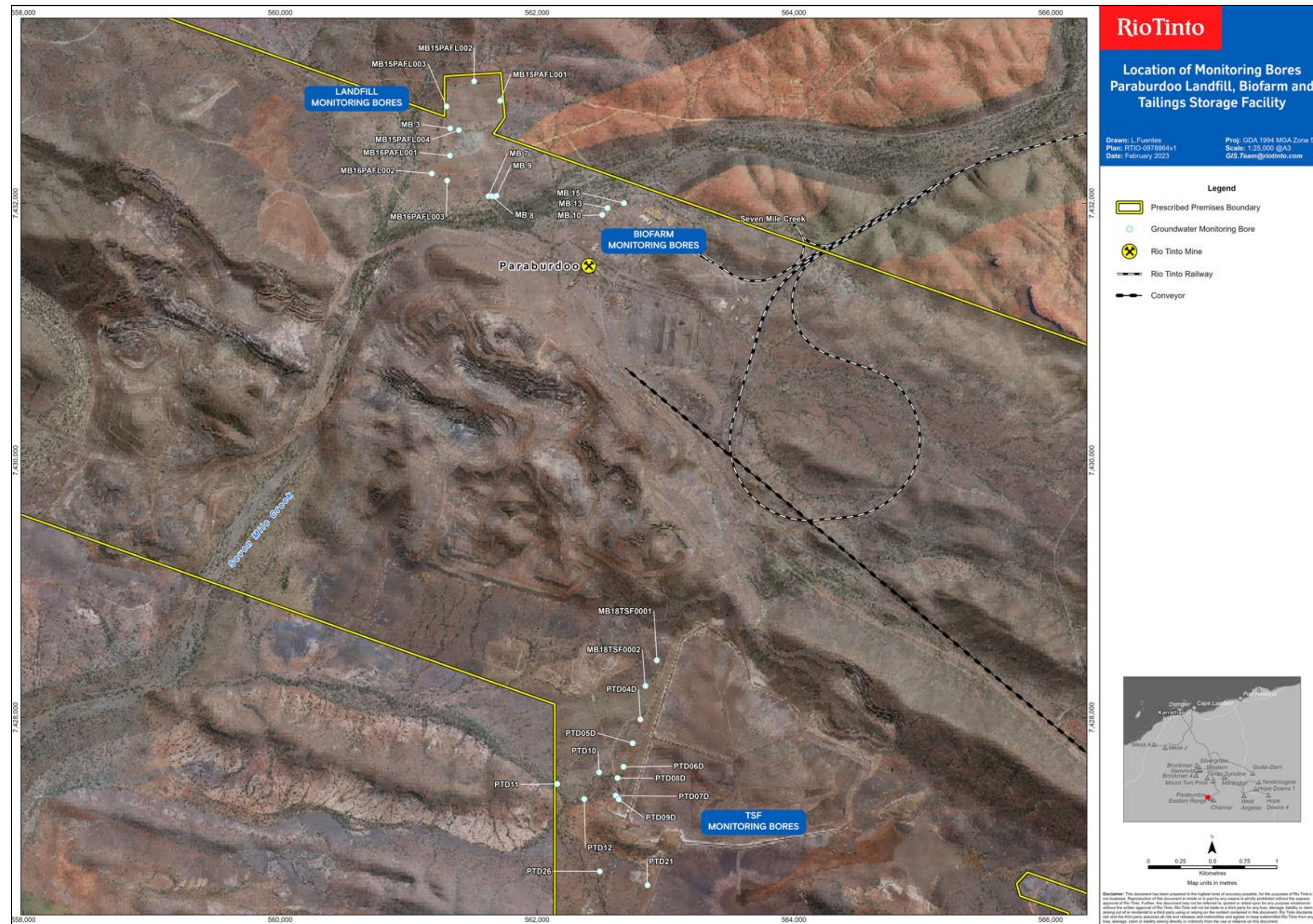
Figure 3: Map of the Groundwater Monitoring Points