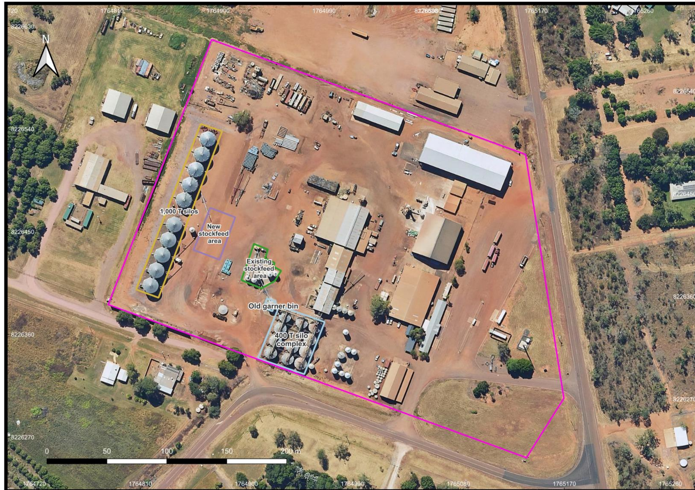
Figure 1: Prescribed premises boundary shown in pink and main infrastructure

The boundary of the prescribed premises is shown in the map below (Figure 1). The pink line depicts the premises boundary. The main infrastructure is shown in Figure 1.