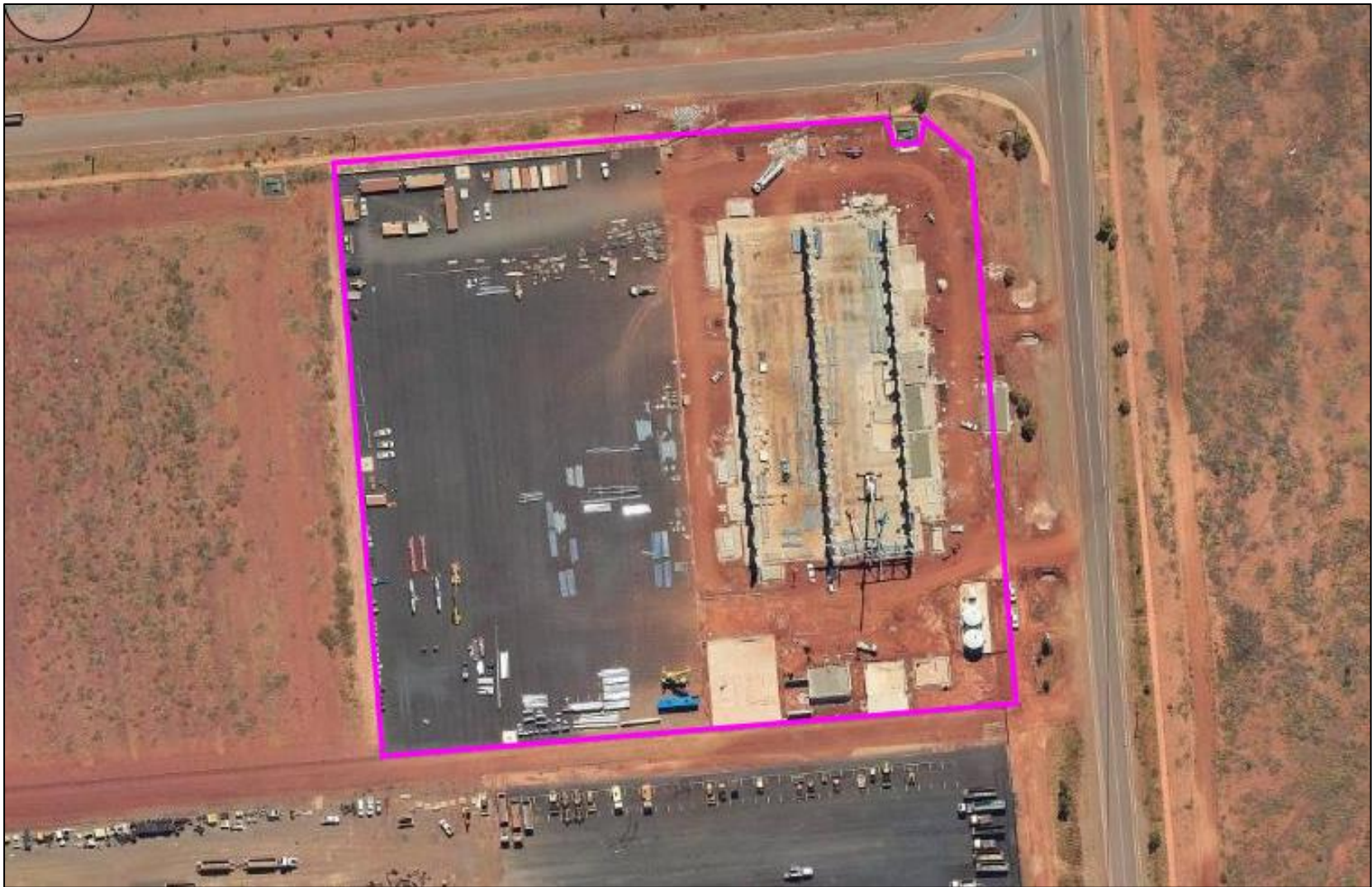
Figure 1: Map of the boundary of the prescribed premises

The boundary of the prescribed premises is shown in the map below.