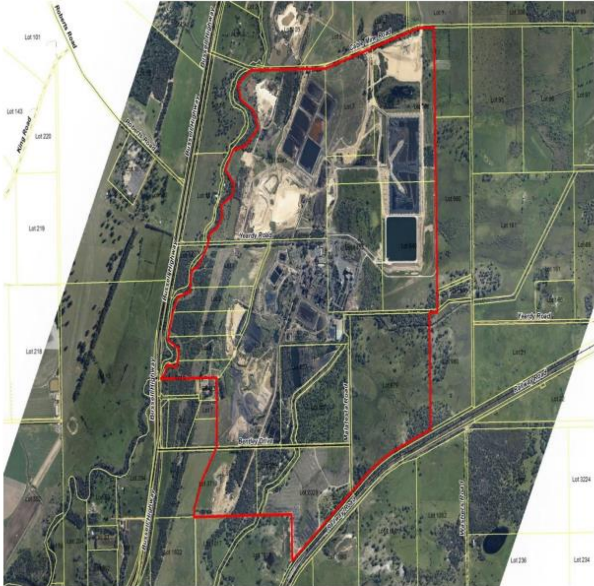
Figure 1: Map of the boundary of the prescribed premises (red outline)

The boundary of the prescribed premises is shown in the map below (Figure 1).