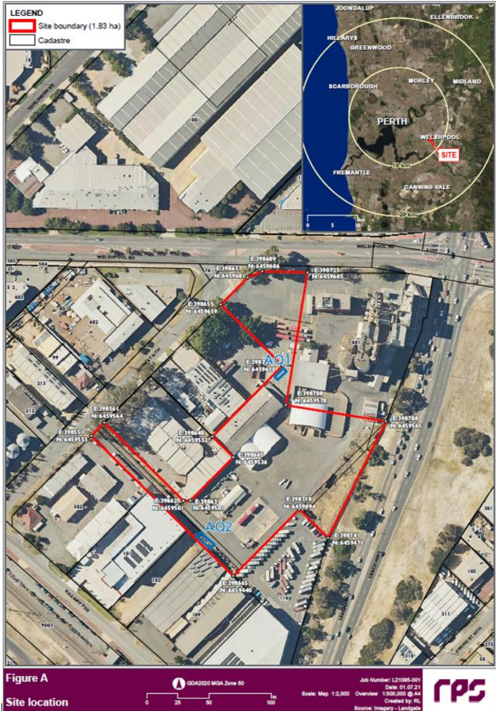
Figure 1: Map of the boundary of the prescribed premises and ambient monitoring

The boundary of the prescribed premises is depicted by the red line in the map below (Figure 1).