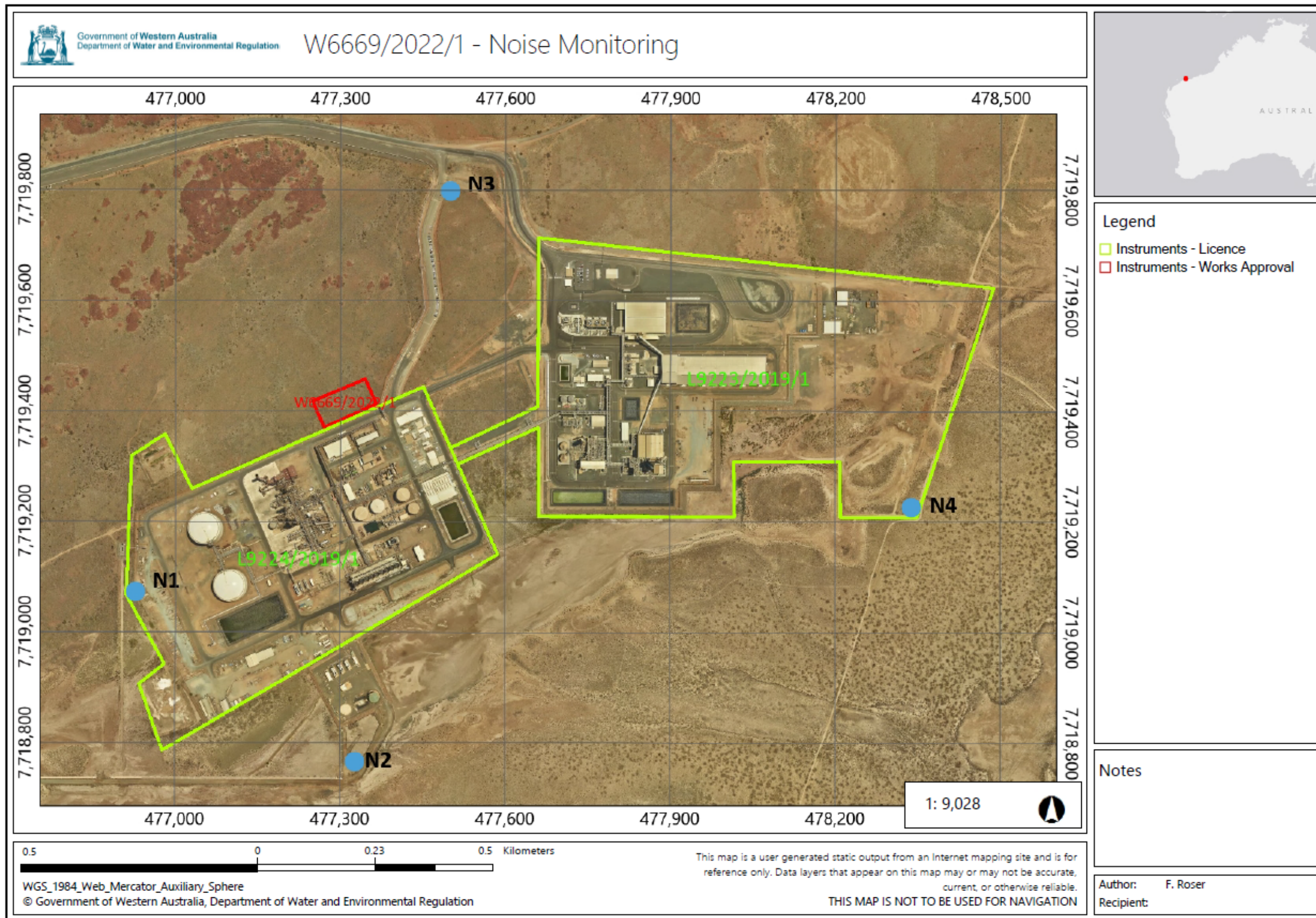
Figure 4: Map of noise monitoring locations