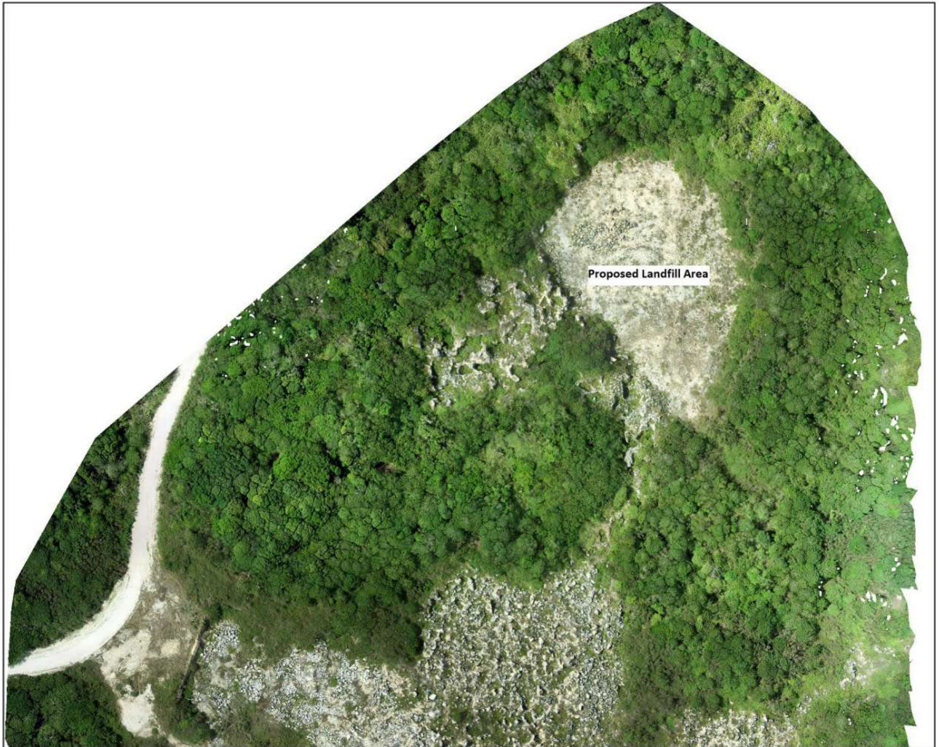
Figure 2: Proposed landfill area