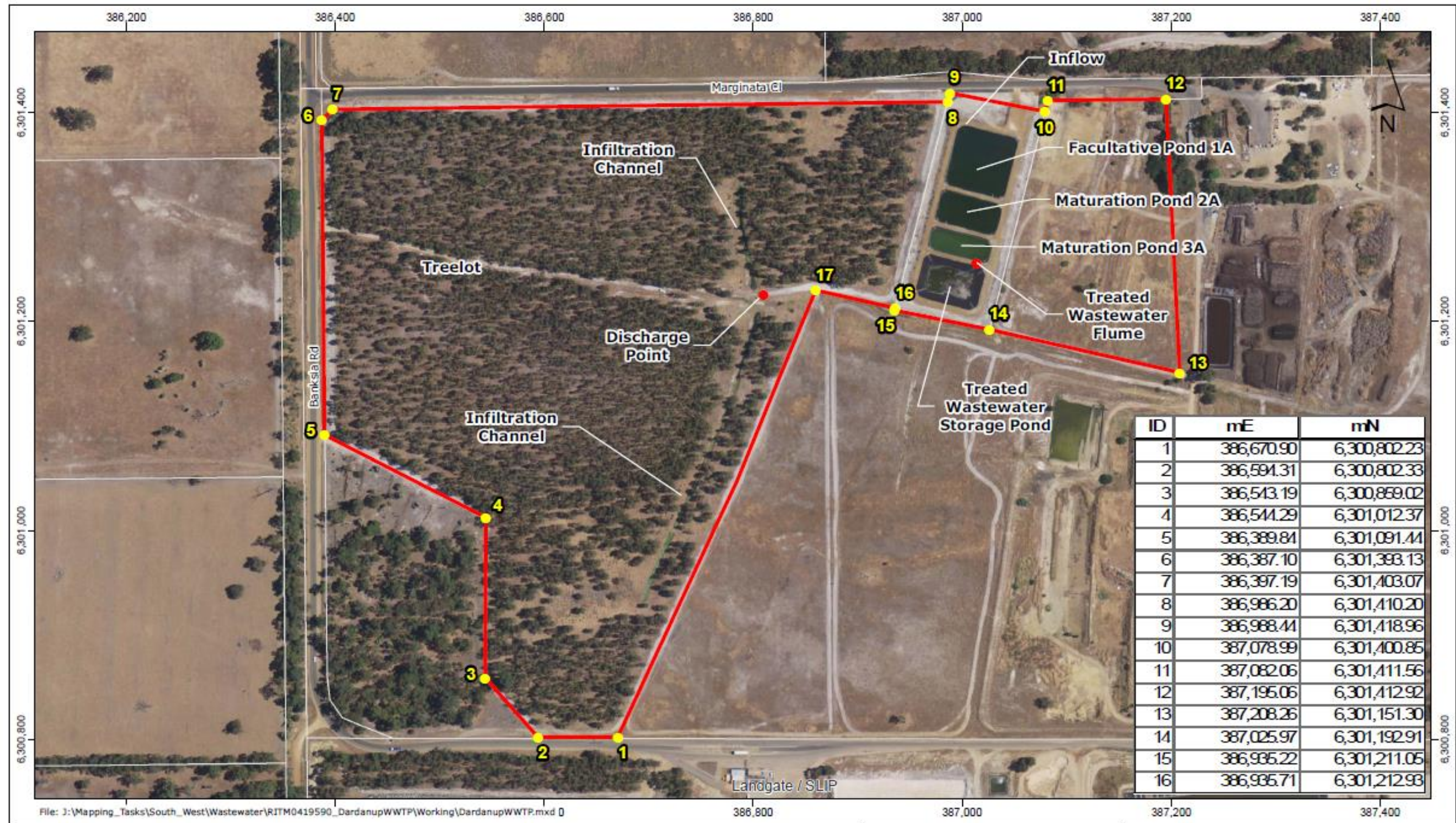
Figure 1: Map of the boundary of the prescribed premises

The boundary of the prescribed premises is shown in the map below (Figure 1).