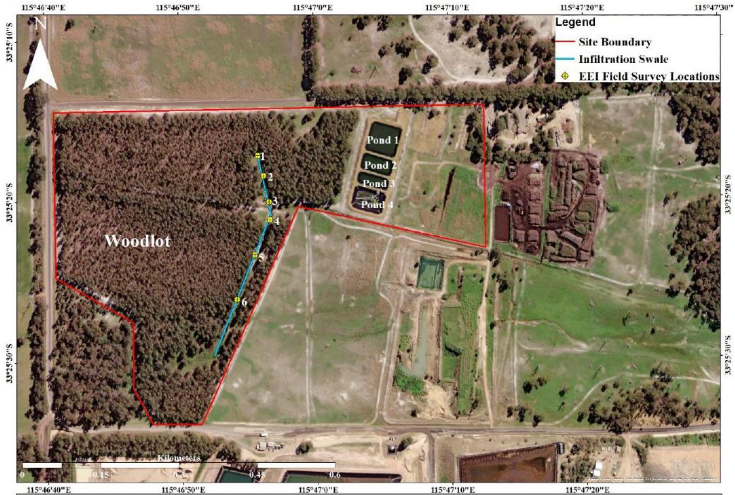
Figure 2: Infiltration channel

The location of the infiltration channel is shown in the map below (Figure 2).