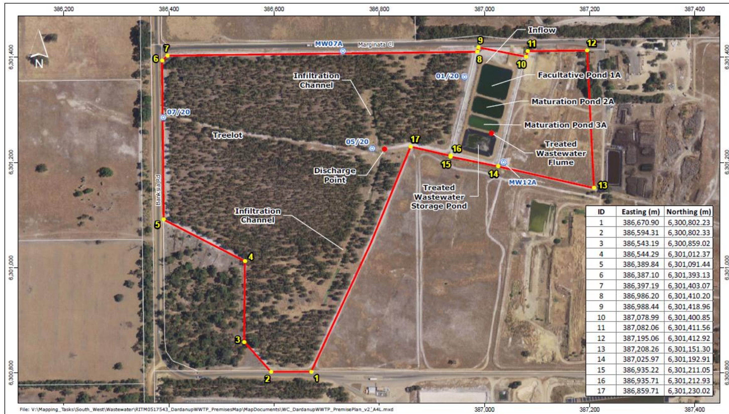
Figure 3: Ambient environmental groundwater monitoring

The locations of the monitoring bores are shown in the map below (Figure 3).