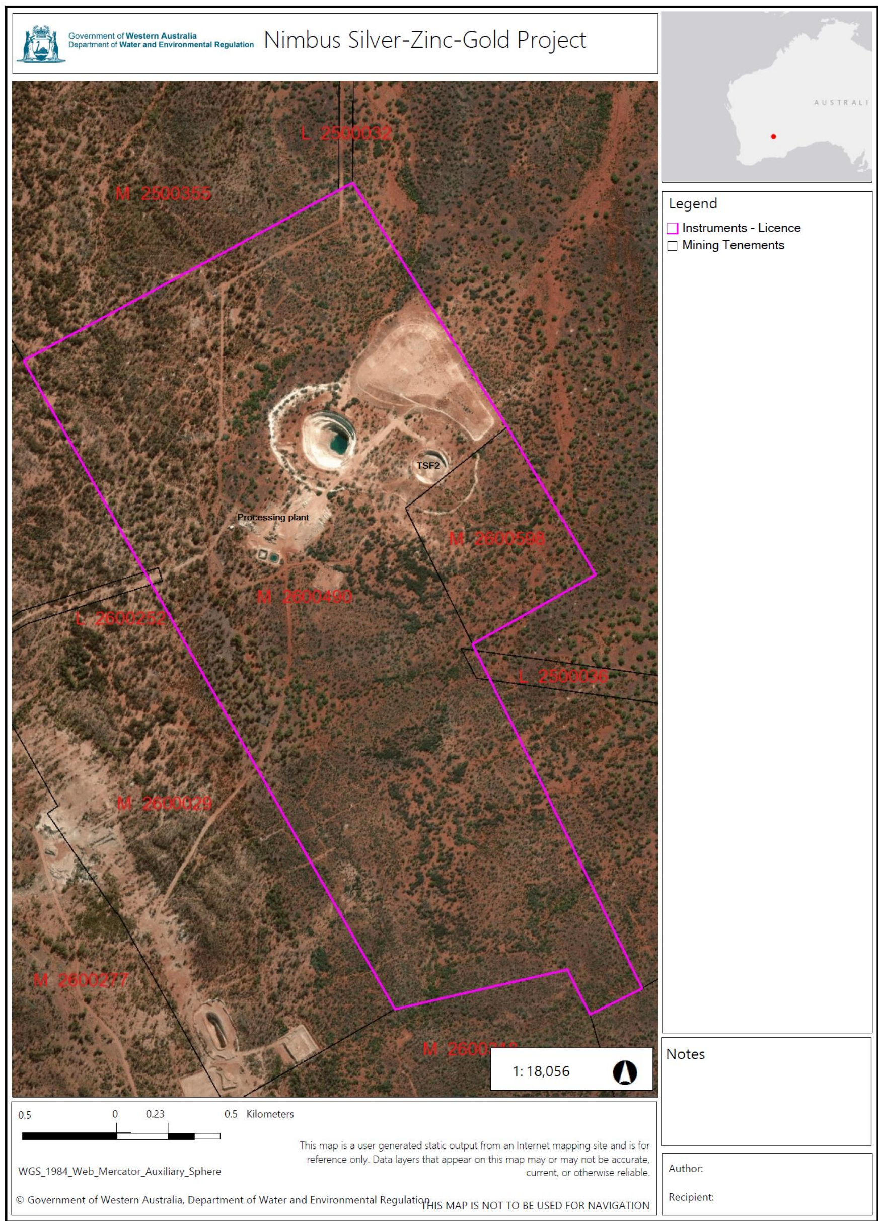
Figure 1: Map of the boundary of the prescribed premises

The boundary of the prescribed premises is shown in the map below (Figure 1).