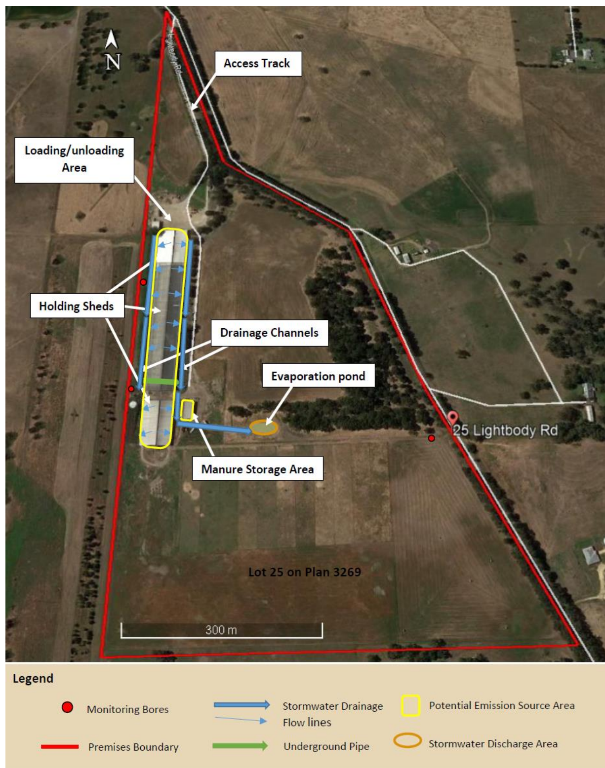
Figure 2: Stormwater run-off containment at prescribed premises is outlined in the map above