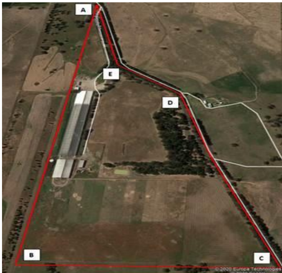
Figure 4: Map outlining GDA94 co-ordinations