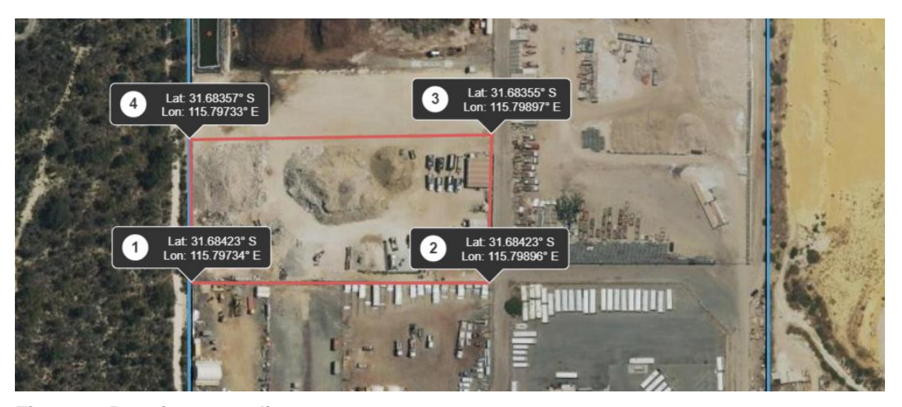
Figure 3: Premises coordinates