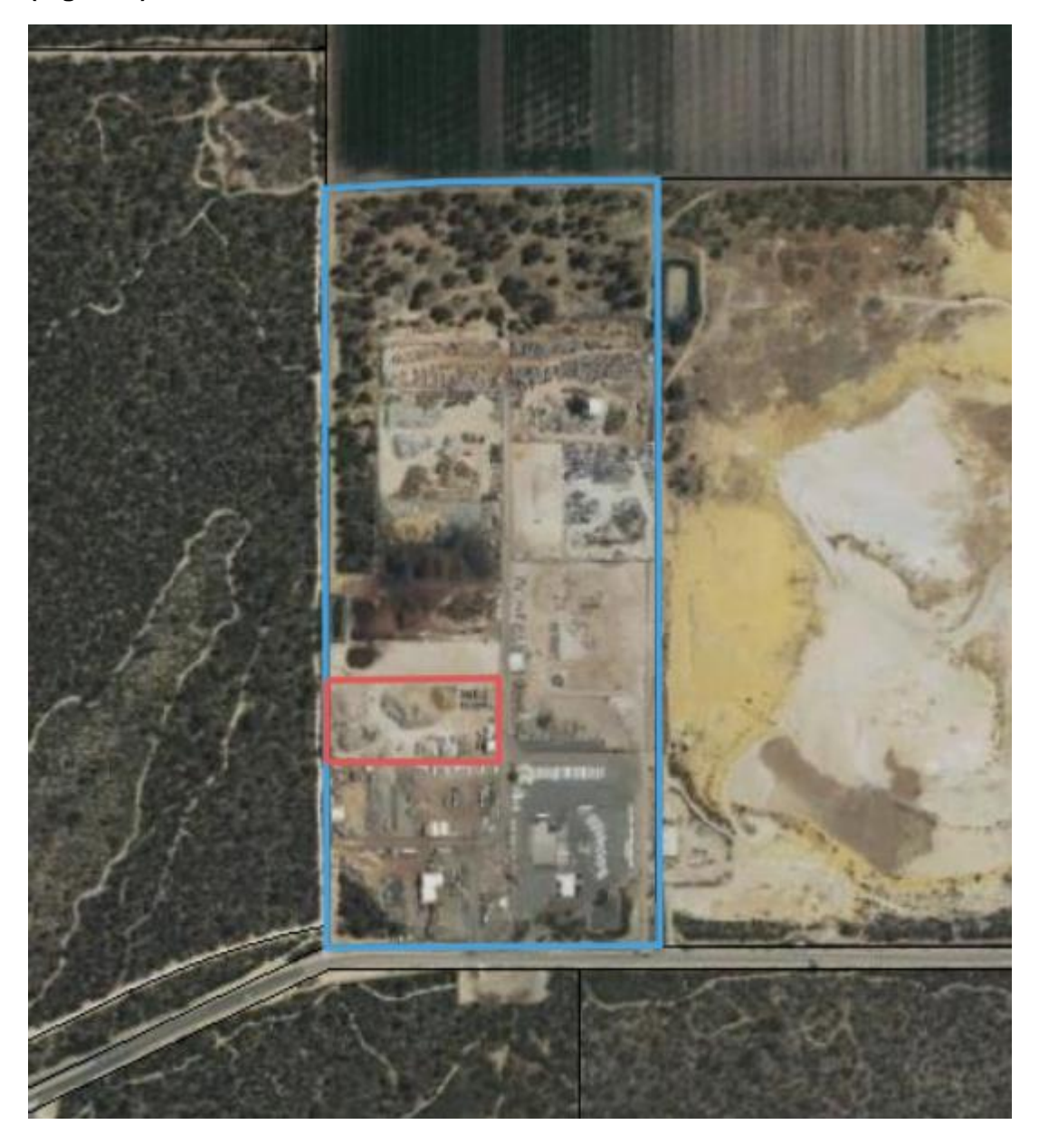
Figure 1: Map of the boundary of the prescribed premises

The boundary of the prescribed premises is shown by the red line in the map below (Figure 1).