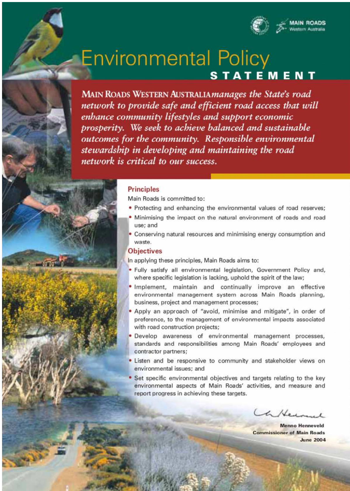
Figure 1: Main Roads Western Australia Corporate Environment Policy