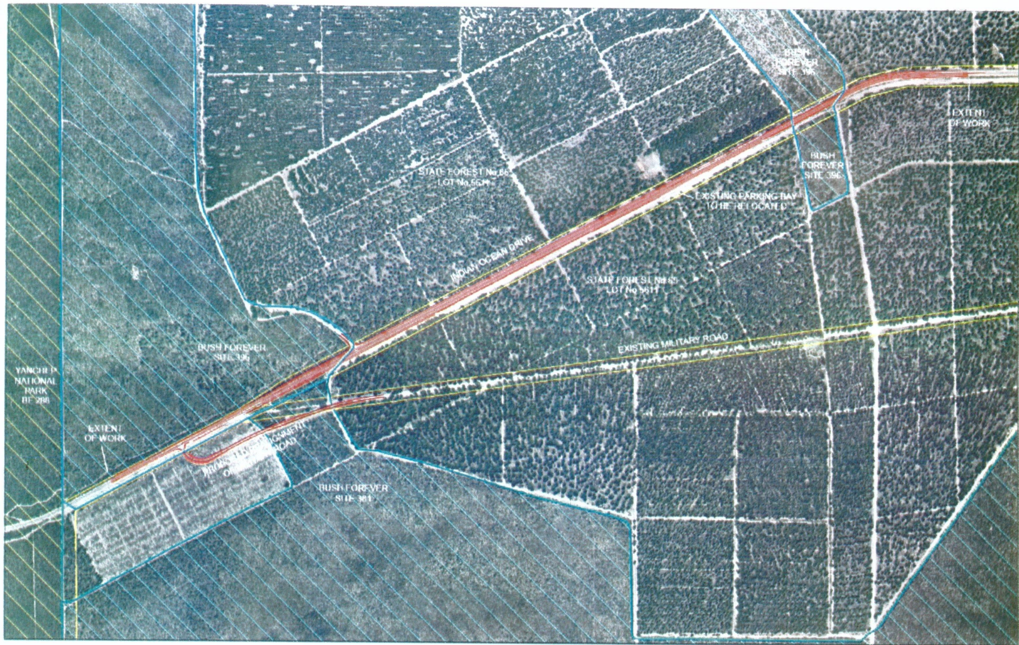
INDIAN OCEAN DRIVE M045 PROPOSED NORTHBOUND & SOUTHBOUND OVERTAKING LANES 6.3 TO 9.2 SLK