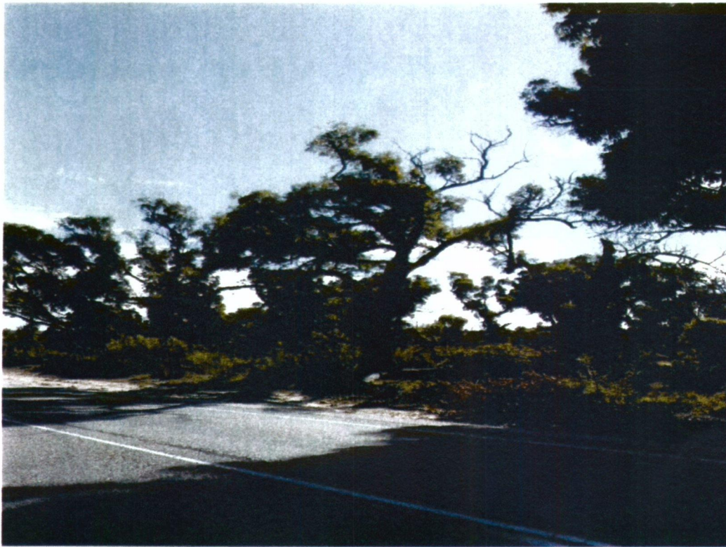
Photo 3 – BUSH FOREVER VEGETATION TO BE CLEARED, EAST OF INDIAN OCEAN DRIVE, SOUTHERN END OF PROJECT, VIEW NORTH-EAST