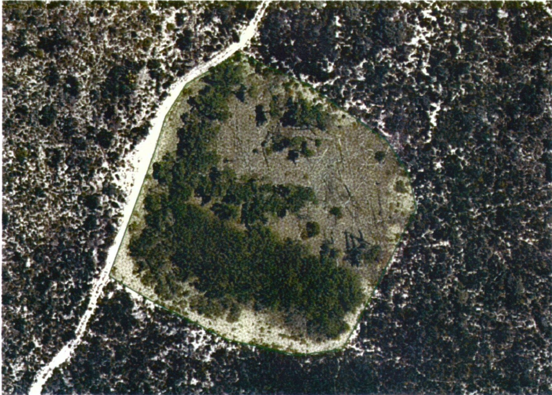
Aerial 4 – Offset area 5 – green speckling showing the proposed rehabilitation of pine research plot