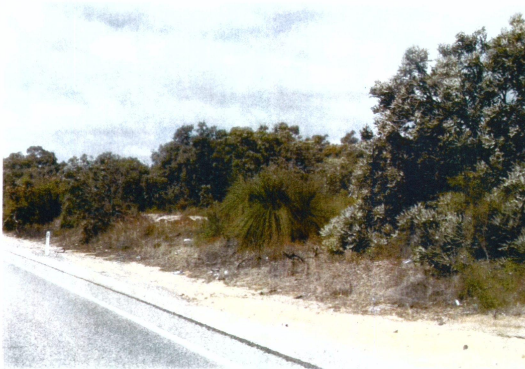
Photo 4 – BUSH FOREVER VEGETATION TO BE CLEARED, WEST OF INDIAN OCEAN DRIVE, NORTHERN END OF PROJECT, VIEW SOUTH-WEST