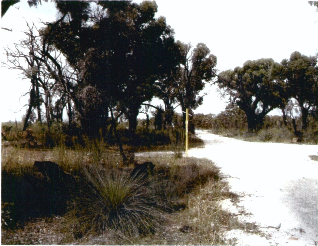
Photo 1 – SOUTH END OF CURRENT MILITARY ROAD, FACING SOUTH TOWARDS INDIAN OCEAN DRIVE