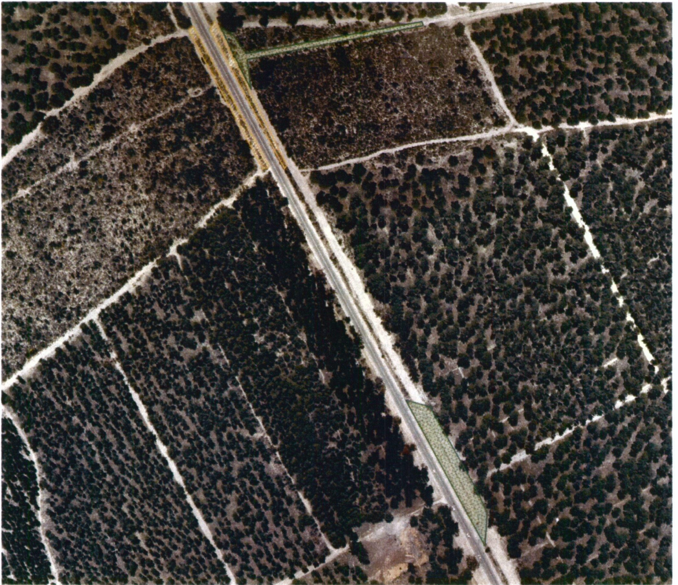
Aerial 3 – Clearing area 2 – orange hatching, potential area of impact in Bush Forever Site 396 Offset area 3 – green speckling showing the proposed rehabilitation of a decommissioned parking bay Offset area 4 – green speckling showing the proposed rehabilitation of the western end of Clover Road