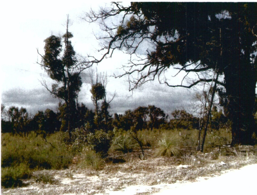
Photo 2 – NORTHERN TIE-IN OF PROPOSED ROAD TO EXISTING MILITARY ROAD, FACING SOUTH – BUSH FOREVER