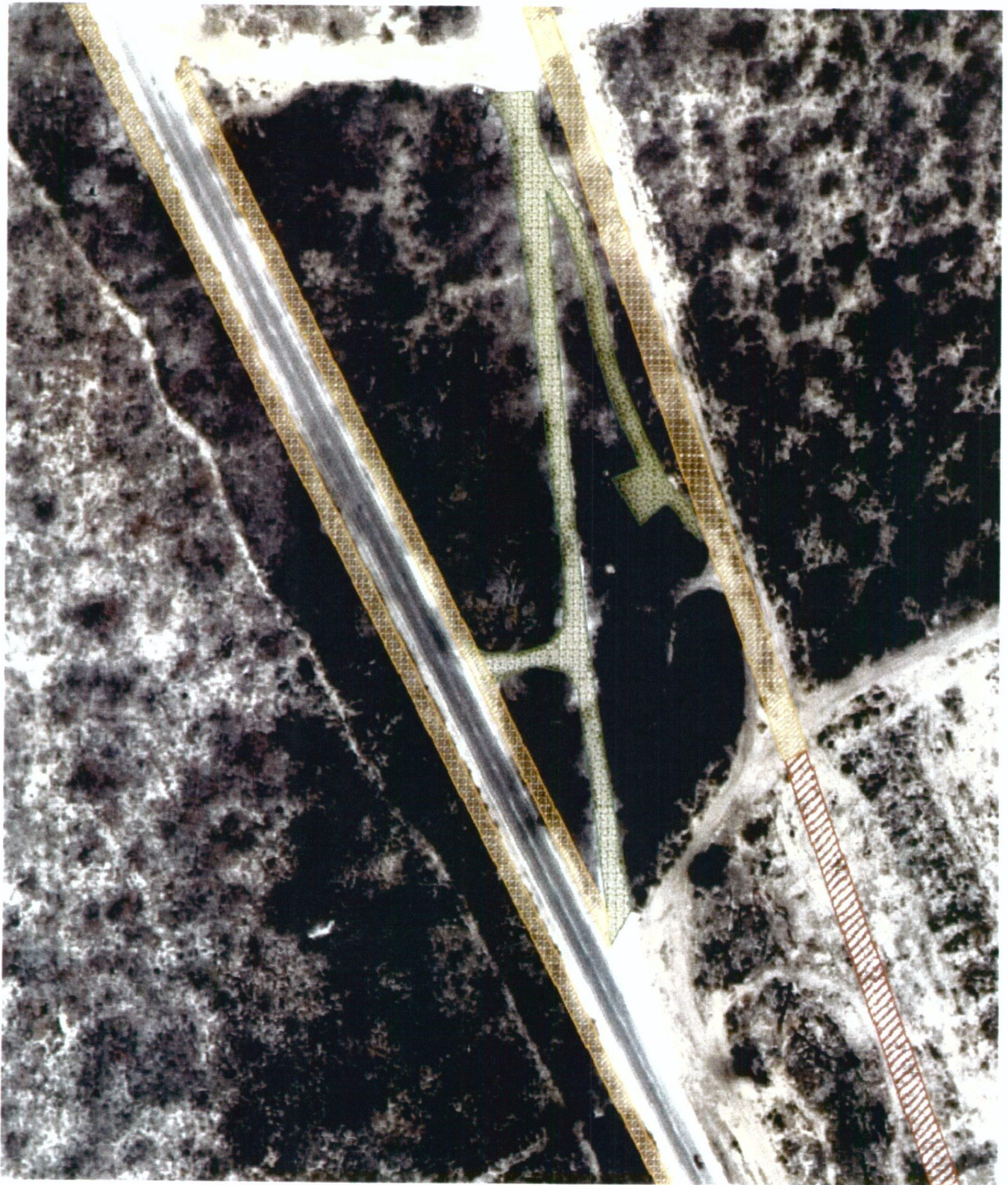
Aerial 1 – Clearing area 1 – orange hatching (Bush Forever) and red hatching (pine plantation) Offset area 1 – green speckling showing the proposed rehabilitation of disused Military Road.