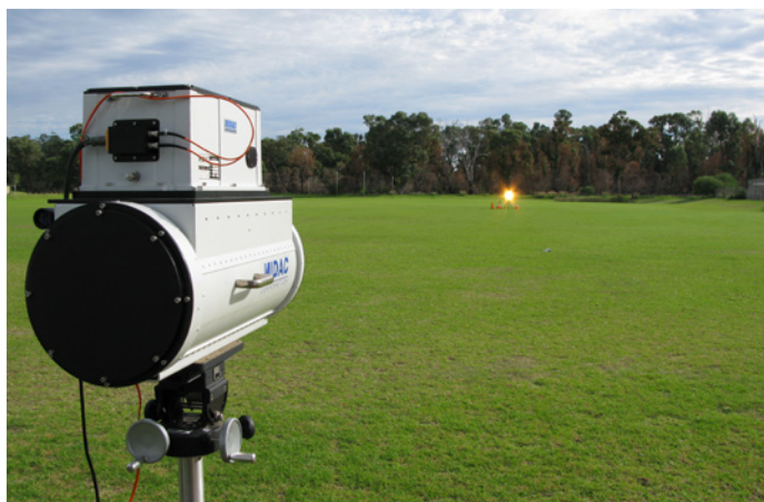
FTIR setup—light source in the distance aligned with the detector

Phase 4 of the Study used a new and improved measurement instrument called a Fourier Transform Infrared Spectrometer (FTIR) to measure air quality averaged over one-hour periods. Previous phases of the Study, conducted in 2005–2006, 2007–2008 and 2009–2010, took samples over longer time periods of up to several days.