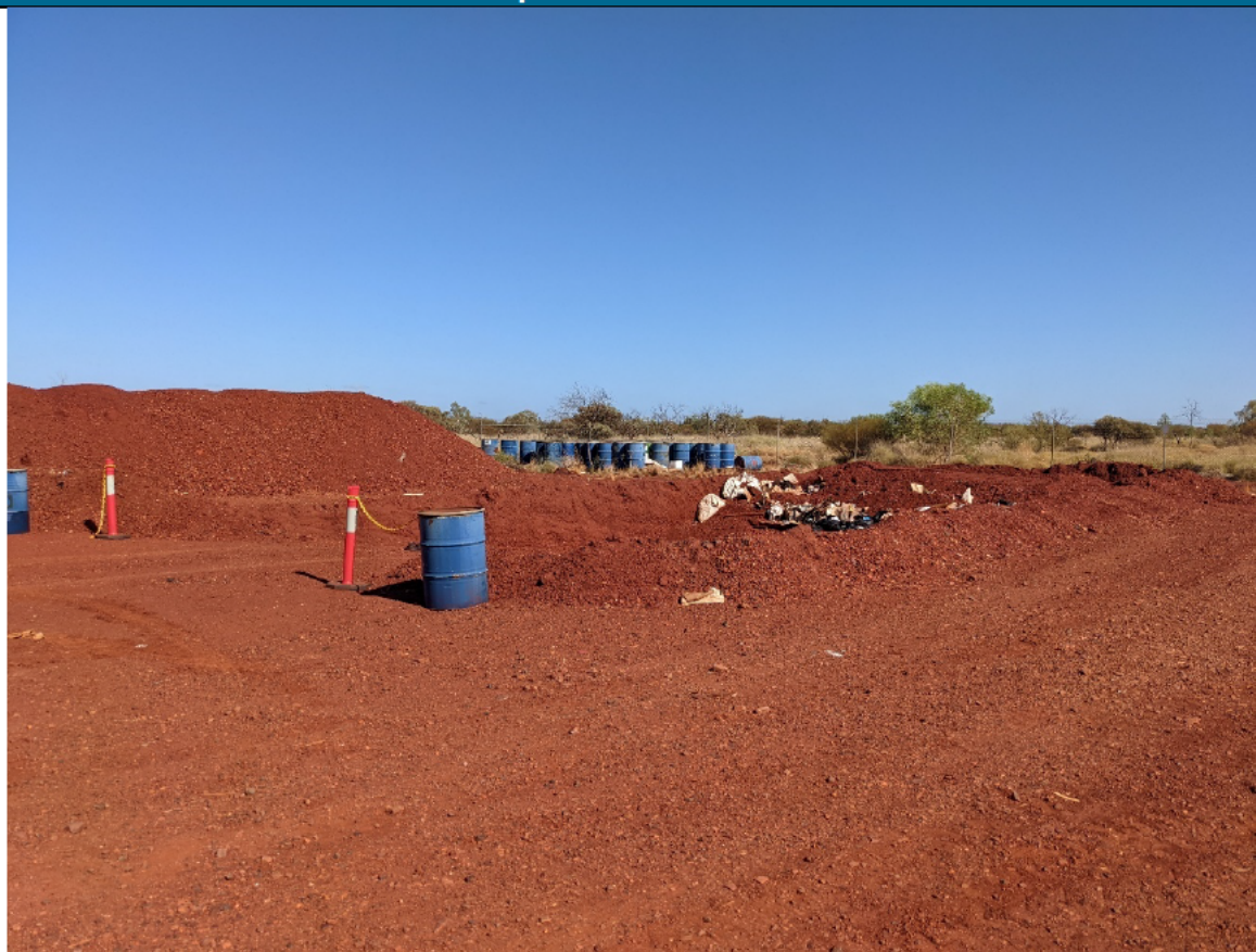
Figure 2. Pit/trench with bund wall