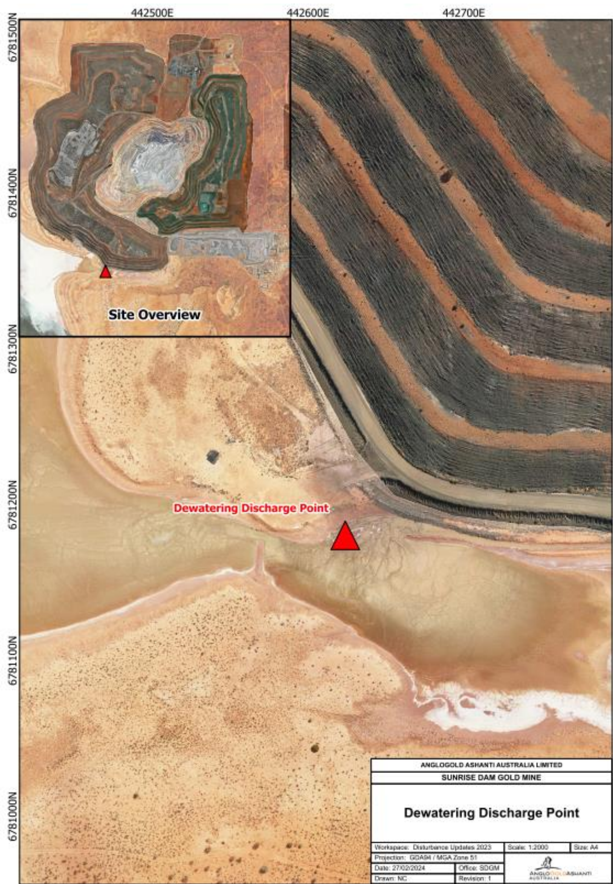
Figure 2 Dewatering Discharge Point Location