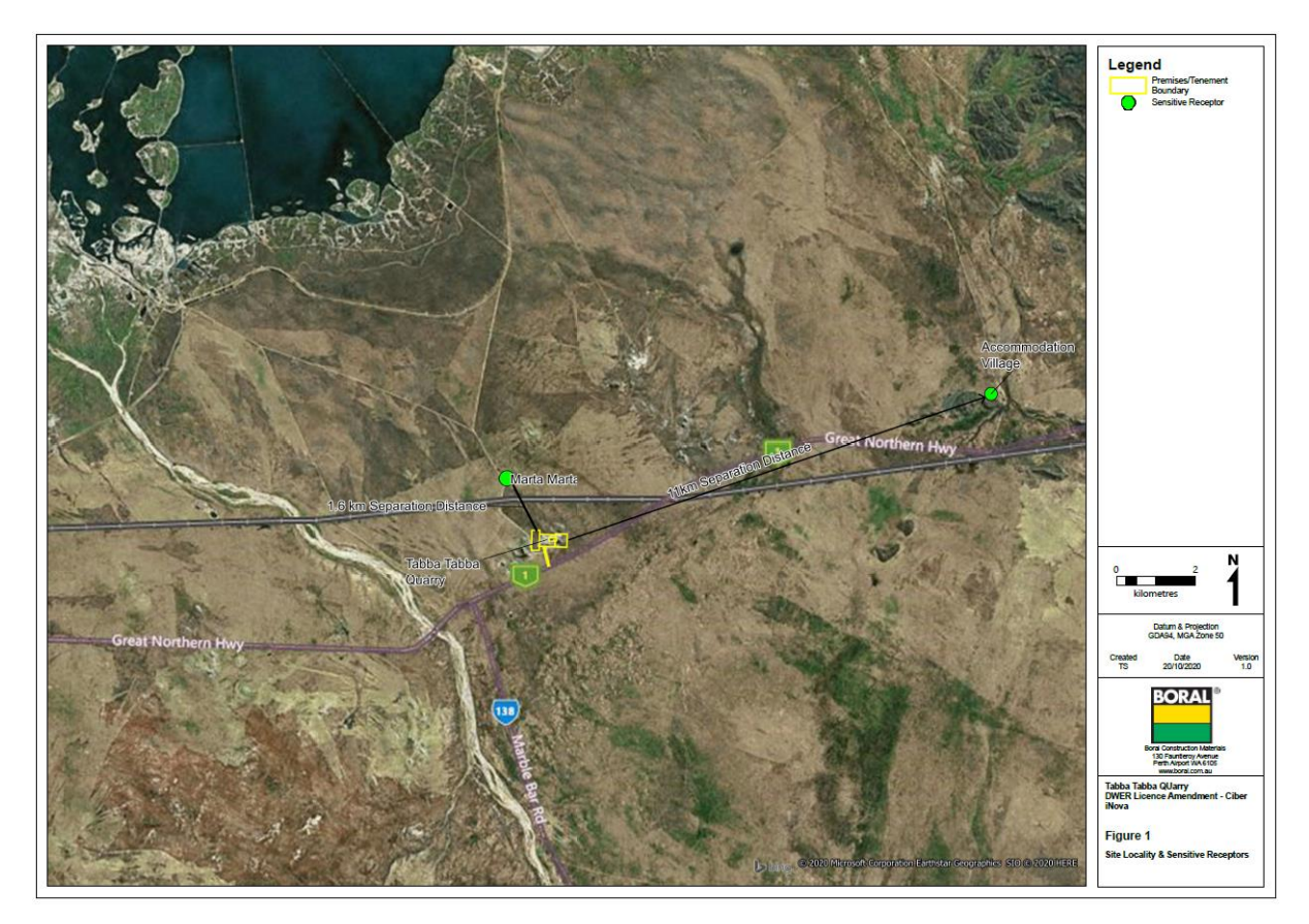
Figure 1: Distance to sensitive receptors