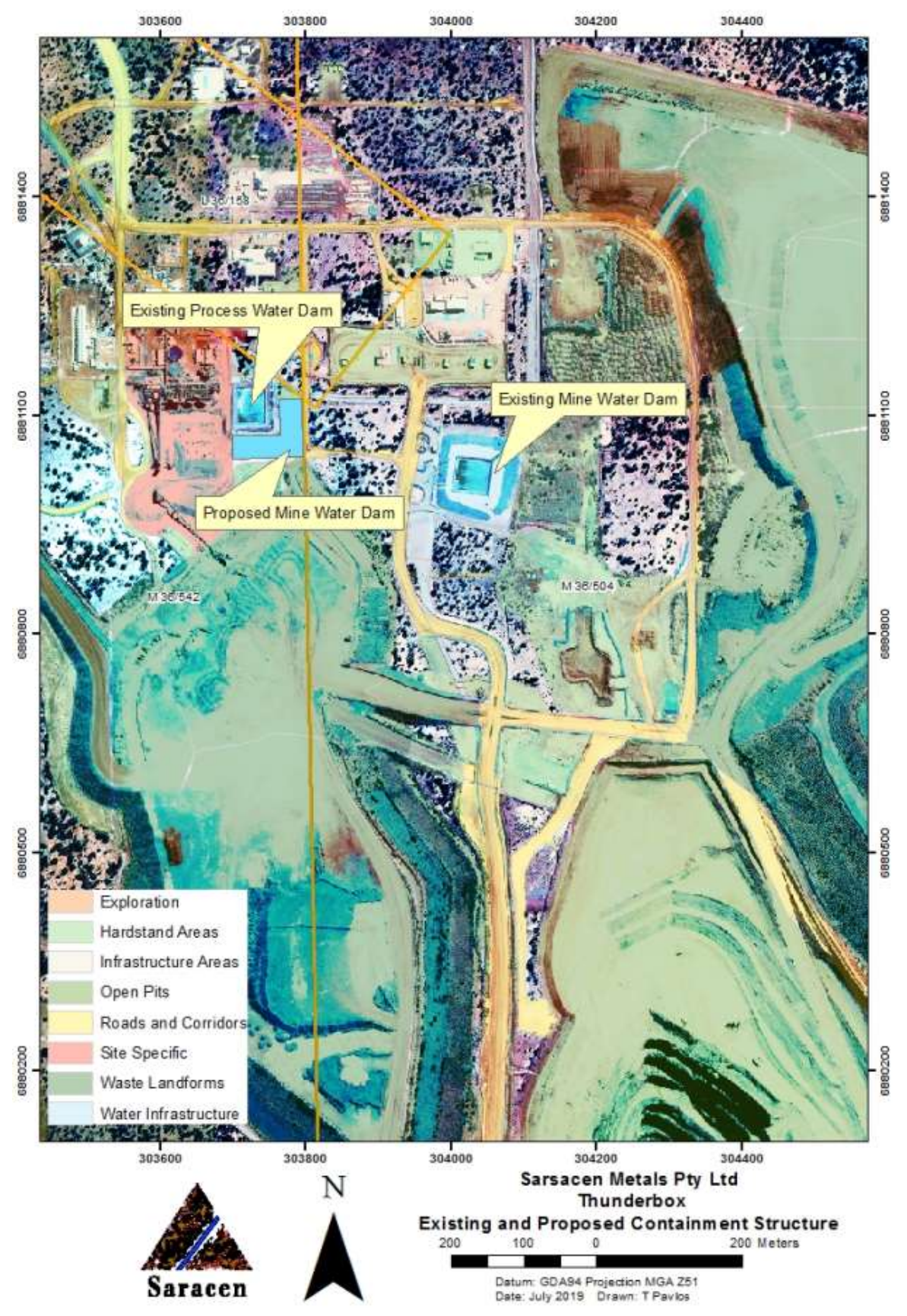
Figure 2: Location of the proposed new mine water dam at Thunderbox.