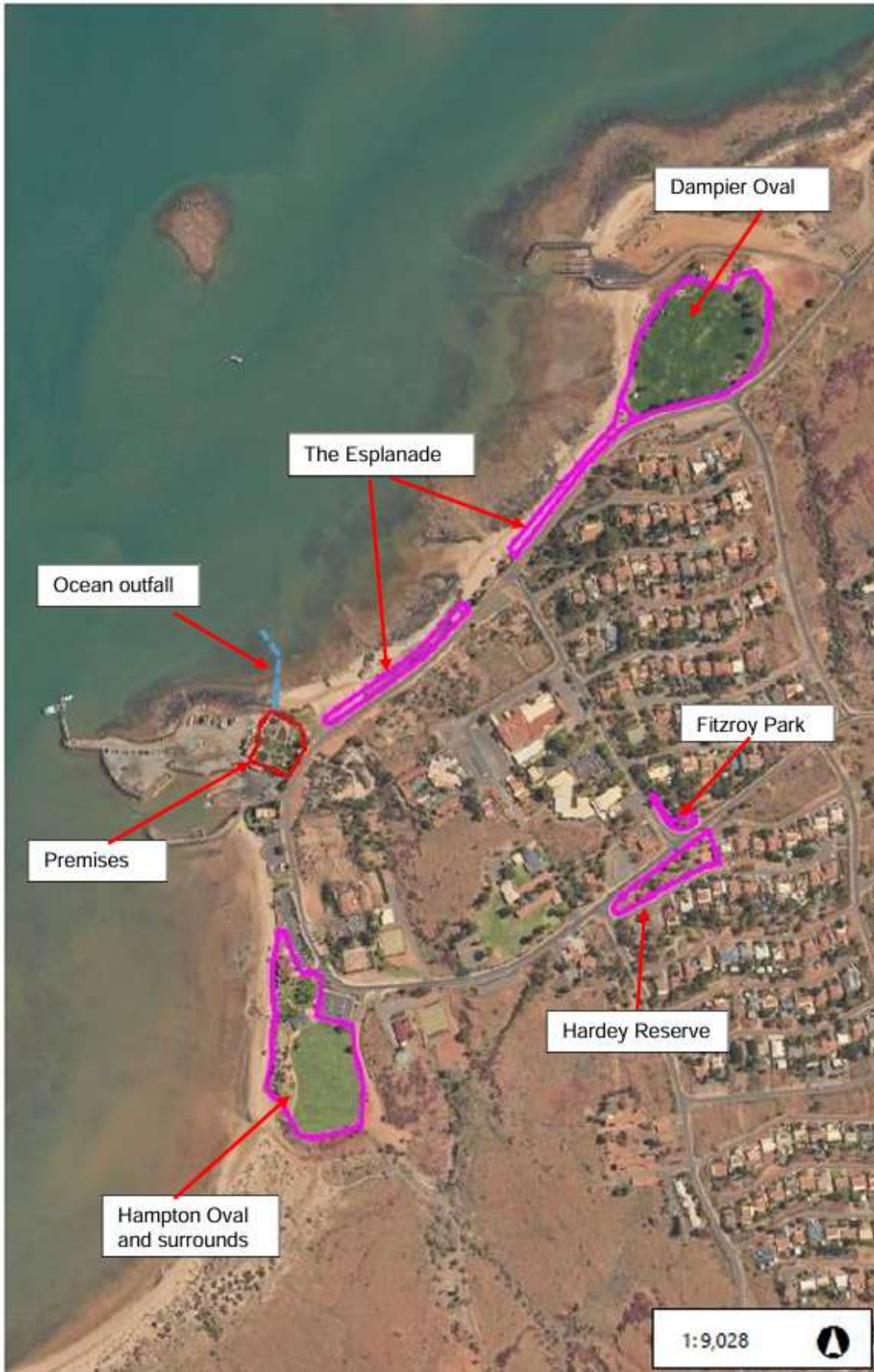
Figure 1: Recycled water reuse locations