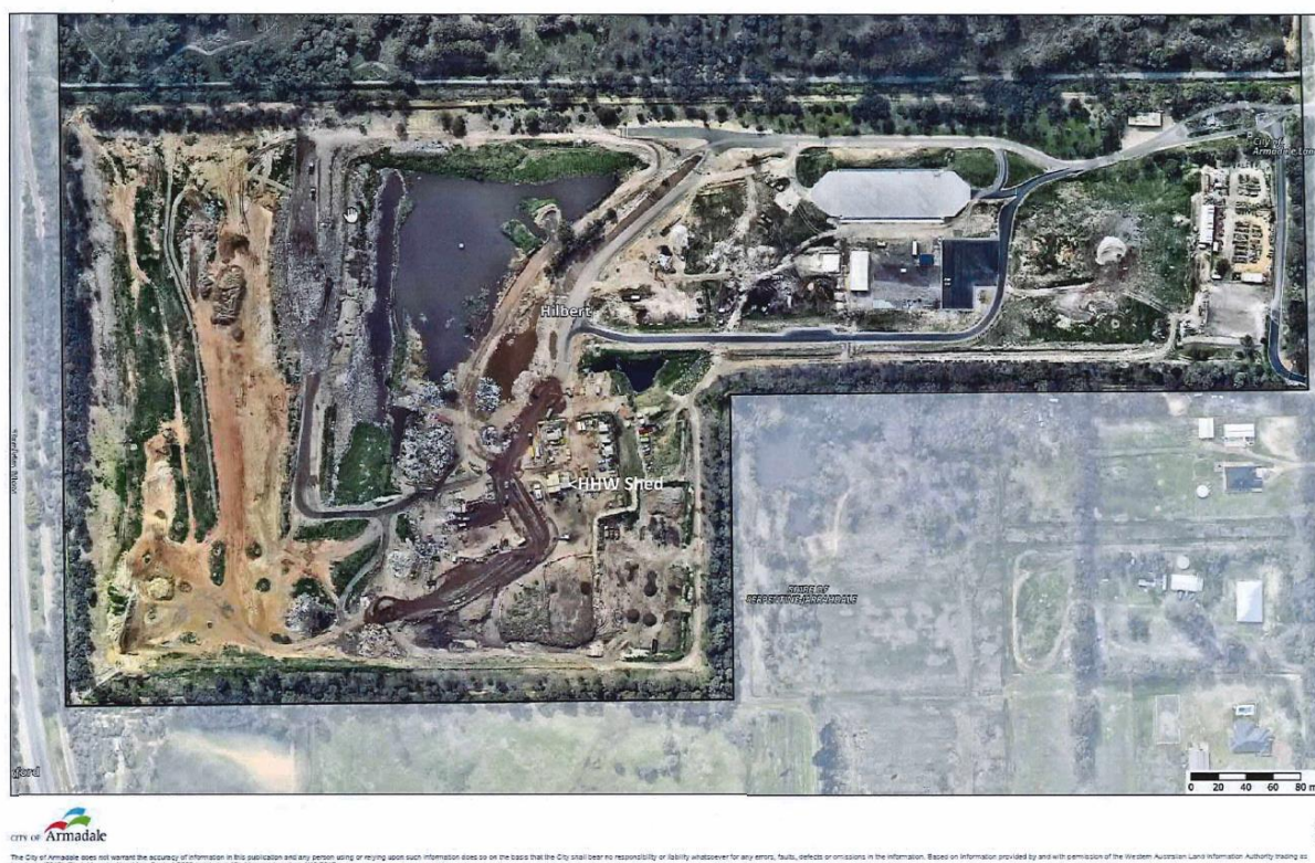
Figure 1: Premises map