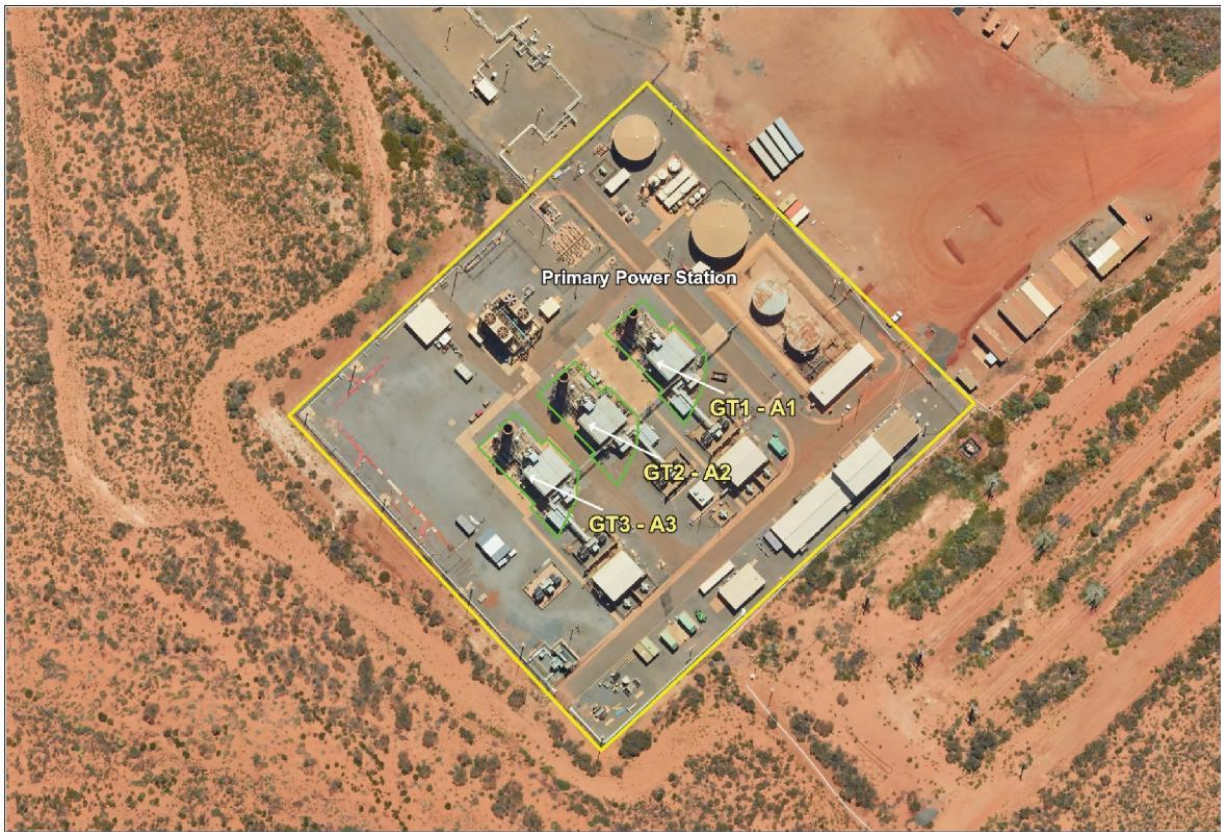
Figure 10 – Primary Power Station Air Emissions Points A1 – A3