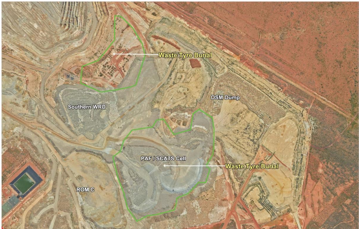
Figure 5 Replacements – Tyre Burial Areas