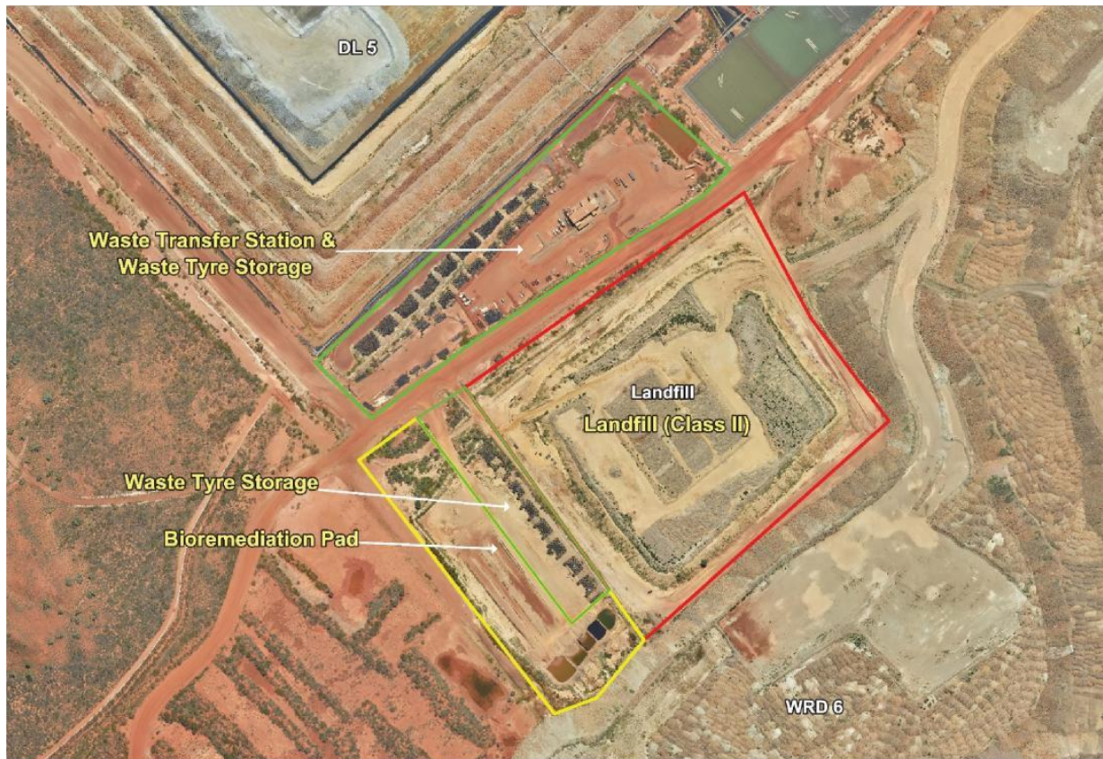
Figure 3 – Class II Landfill, Tyre Storage/Burial Areas and Bioremediation