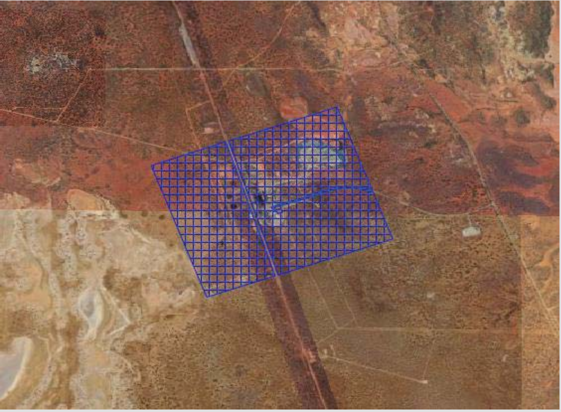
Figure 1 – CPS 8164/1 application area

Comments The local area considered in the assessment of the application is described as a 20 kilometre radius measured from the application area. The local area retains approximately 70 per cent native vegetation cover.