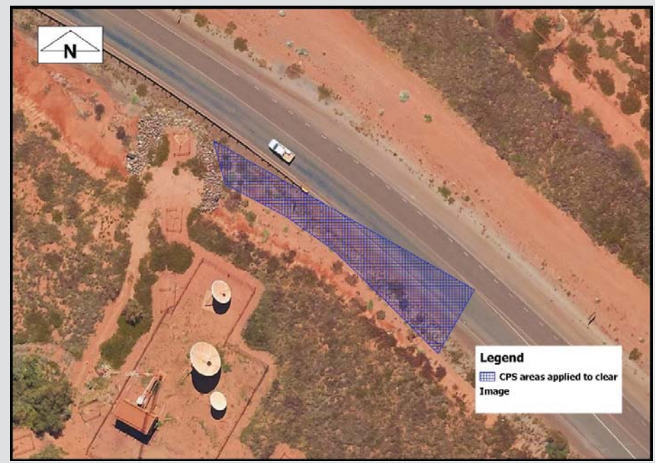
Figure 1: Application area