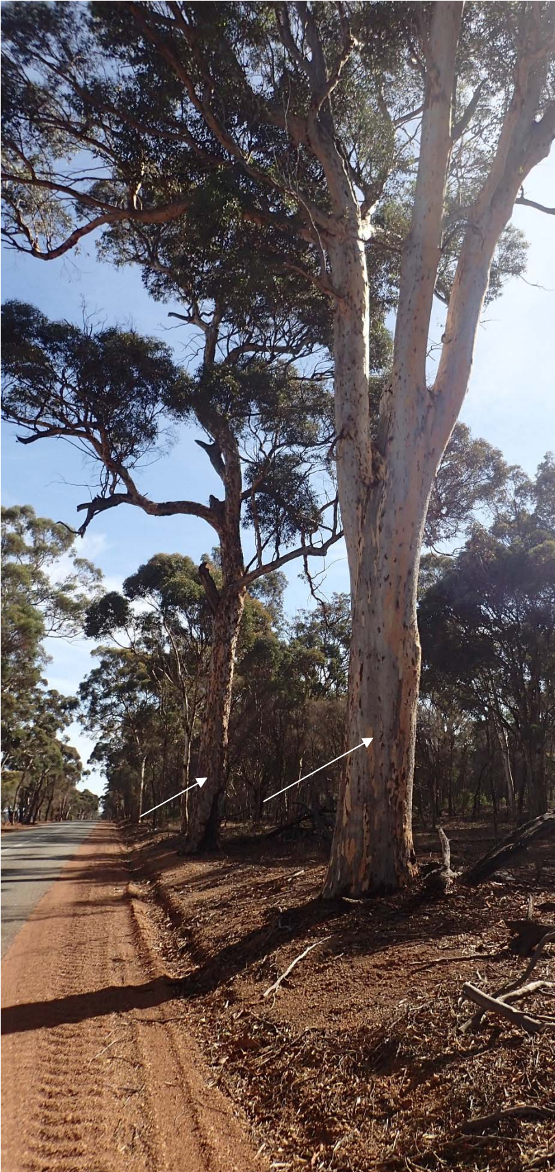
Figure 3. Two large trees with hollows within the application area