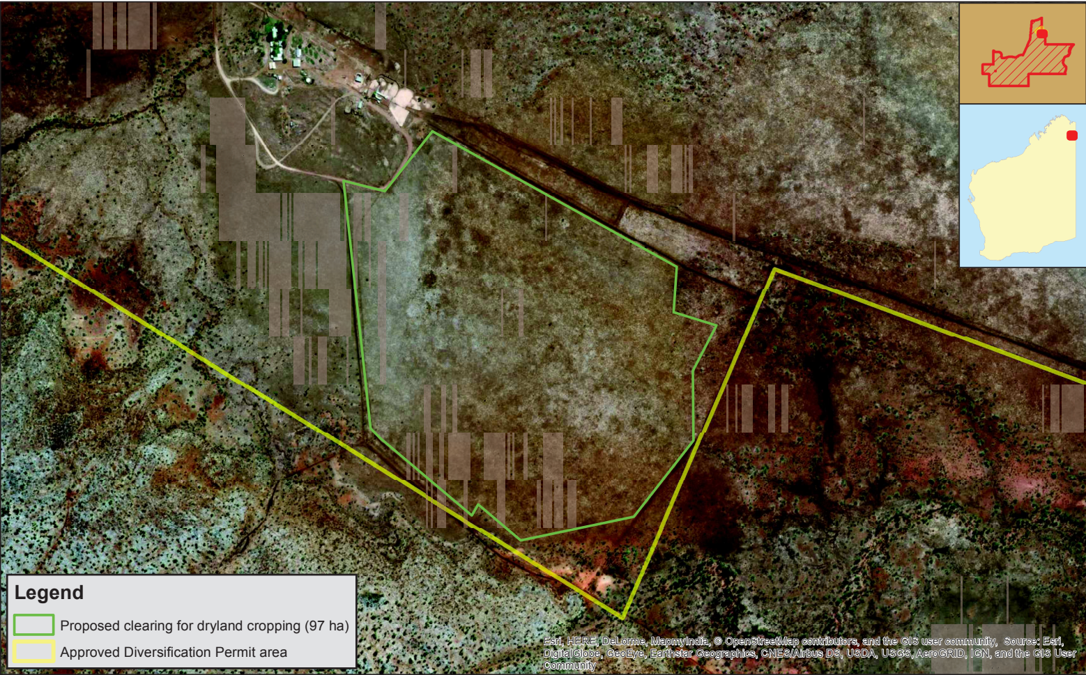
Lissadell Station proposed new area for clearing for dryland cropping. Lissadell Pastoral Group Figure 3

Coordinate System: WGS_1984_UTM_Zone_52S Datum: GDA94 Drawn by: Brenda Powell Date: 5/01/2018