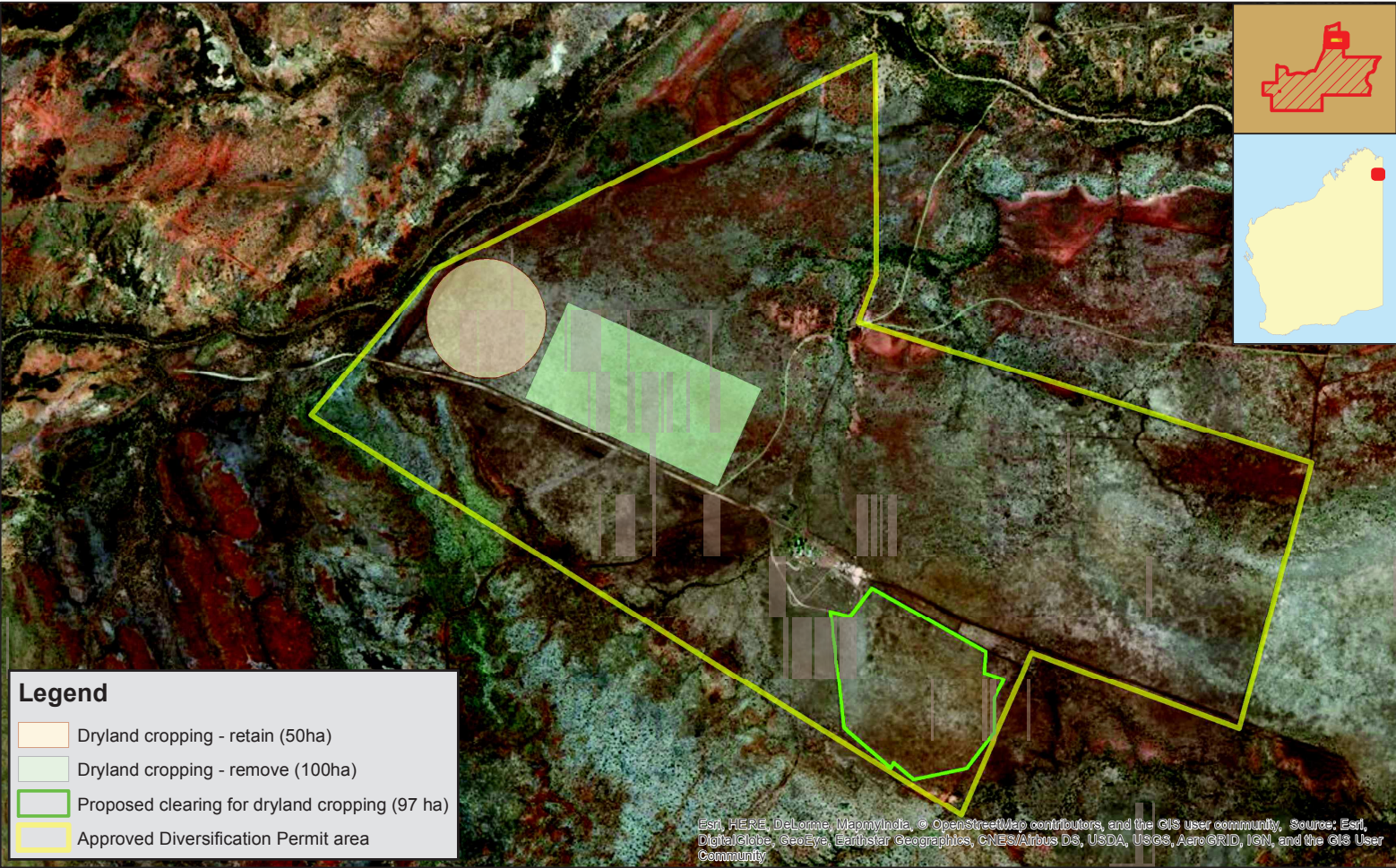
Lissadell Station proposed amended clearing area for dryland cropping. Lissadell Pastoral Group Figure 2