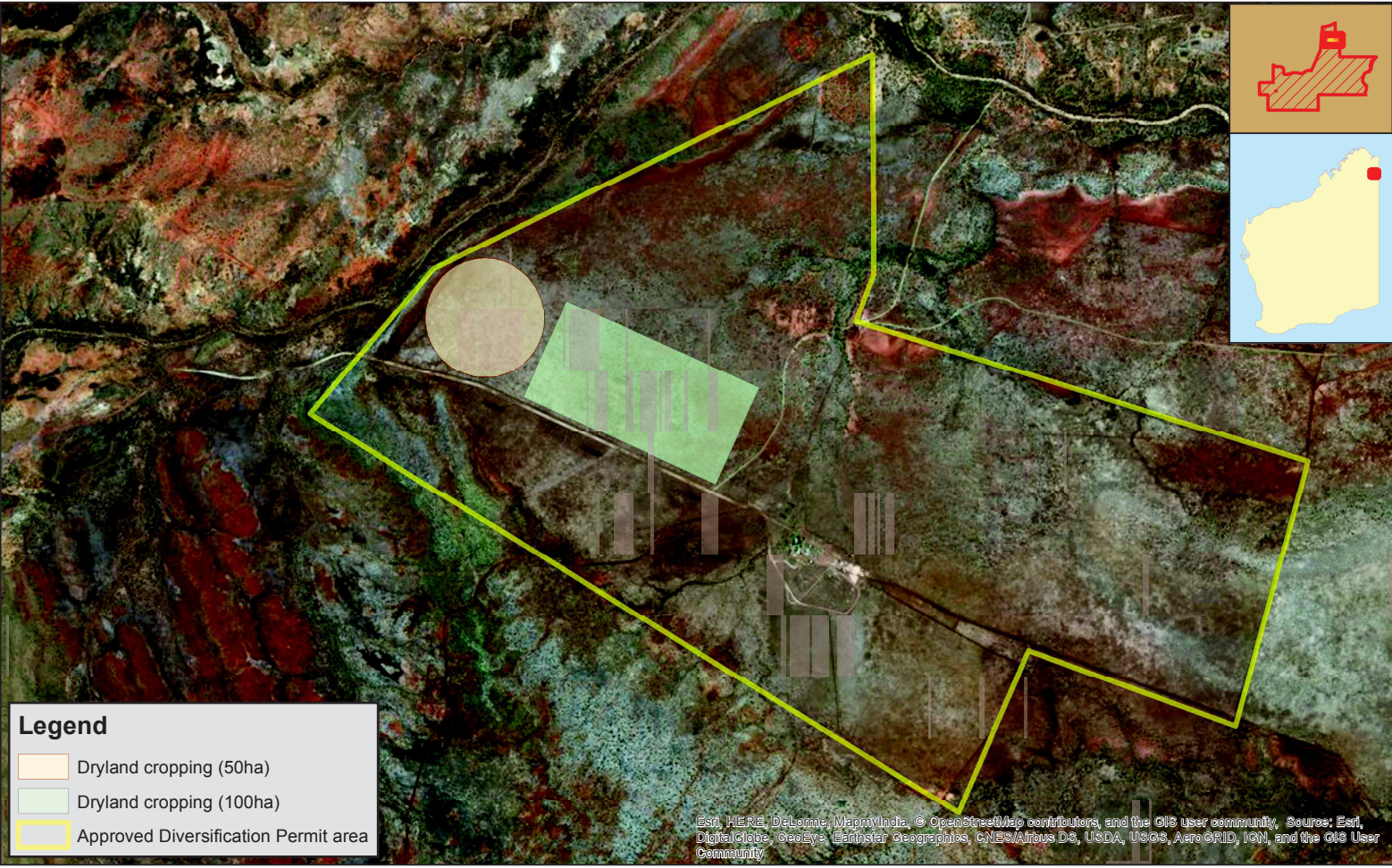
Lissadell Station approved areas for clearing for dryland cropping. Lissadell Pastoral Group Figure 1