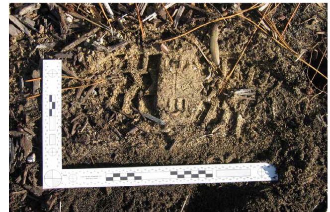
Photos: Top – Officer sampling pollutants from waterway. Above – Evidence taken by officer.