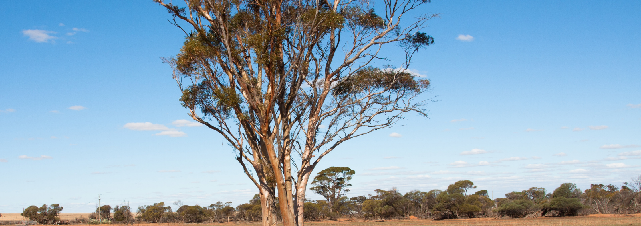
Photo: A farm and native vegetation in Koorda area.