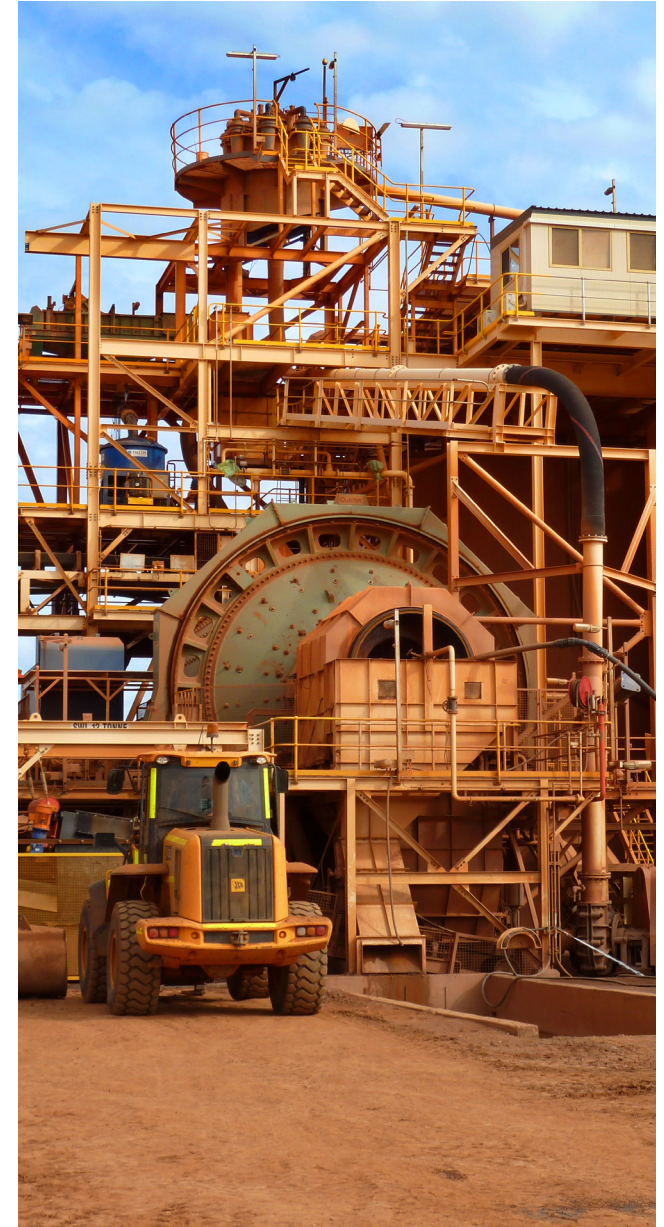
Photo: Moolart Well, Goldfields.

Waste Policy and Programs – facilitating enhanced and coordinated waste management.