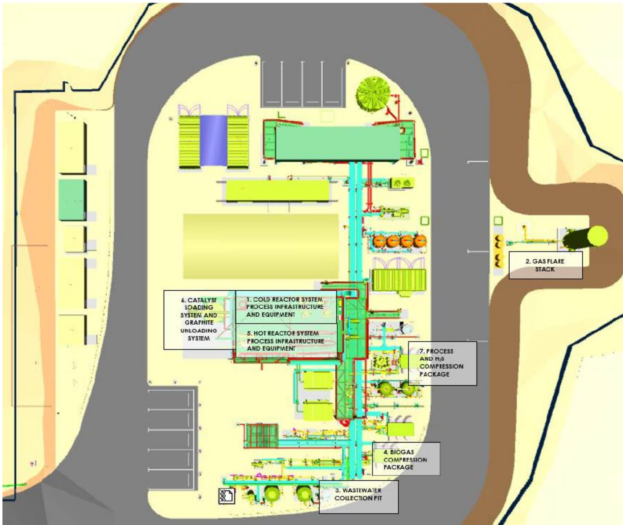
Figure 2: Map of the boundary of the prescribed premises