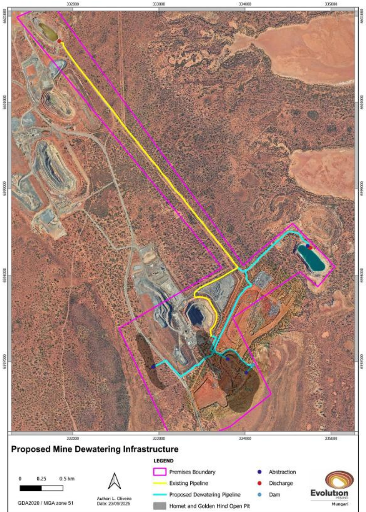
Figure 2: Proposed mine dewatering infrastructure