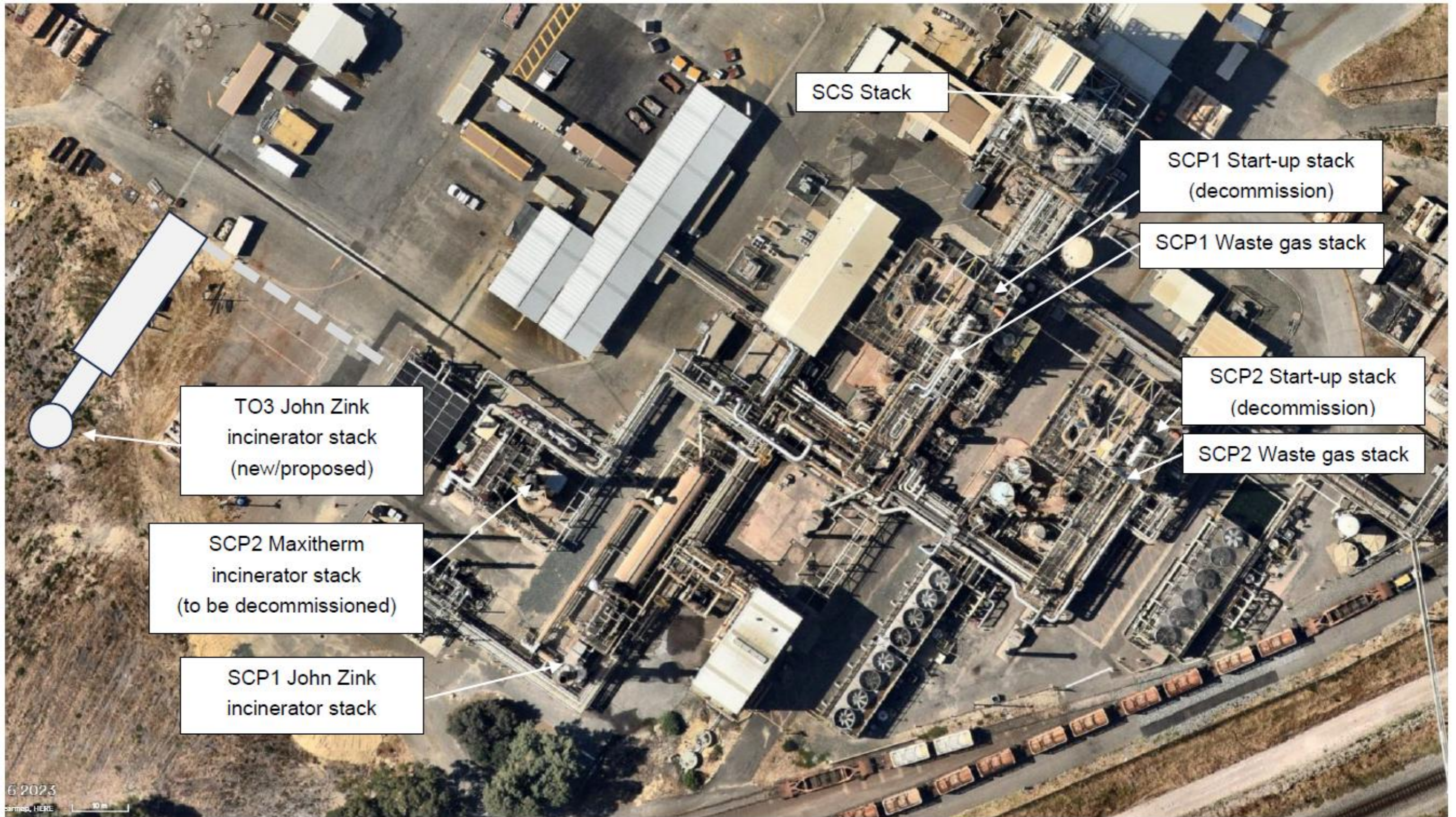
Figure 4: Emissions to air discharge locations.