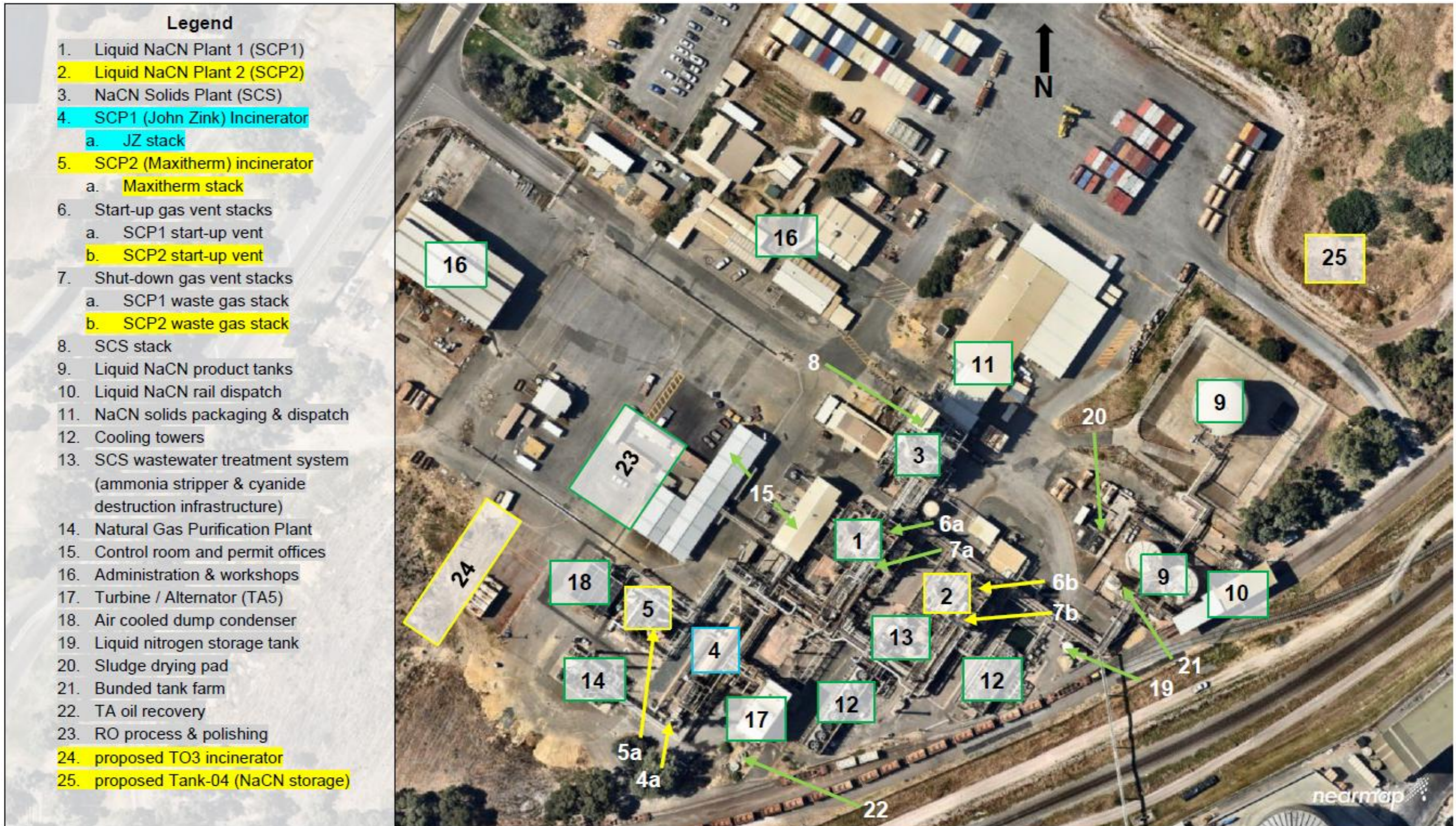
Figure 2: General layout of Sodium Cyanide Manufacturing Facility.