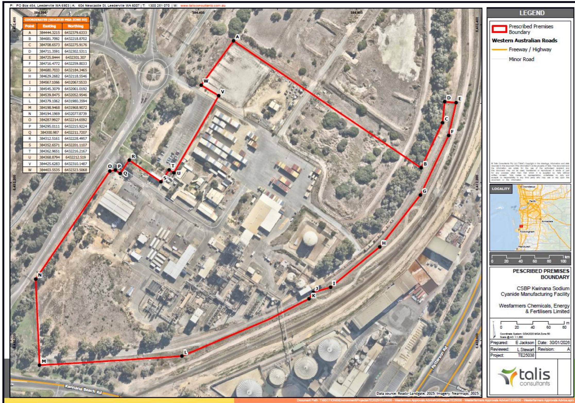
Figure 1 Map of the boundary of the prescribed premises.

The boundary of the prescribed premises is shown in the map below (Figure 1).