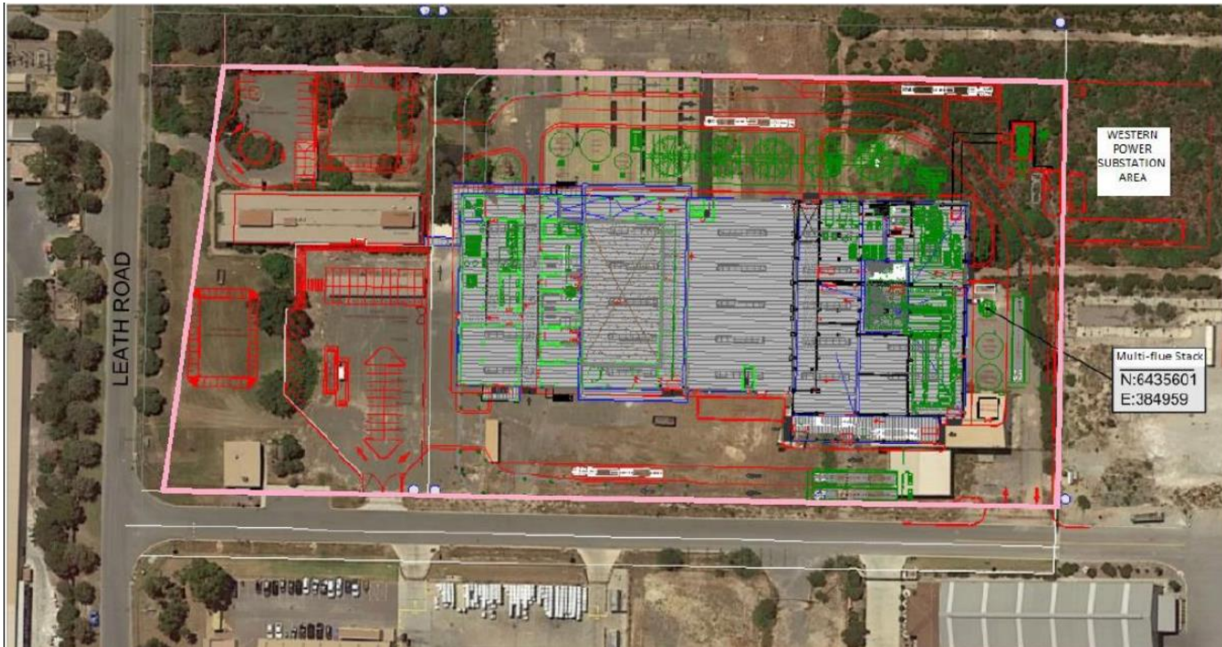
Figure 1: Map of the boundary of the prescribed premises

The boundary of the prescribed premises is shown in pink in the map below (Figure 1).