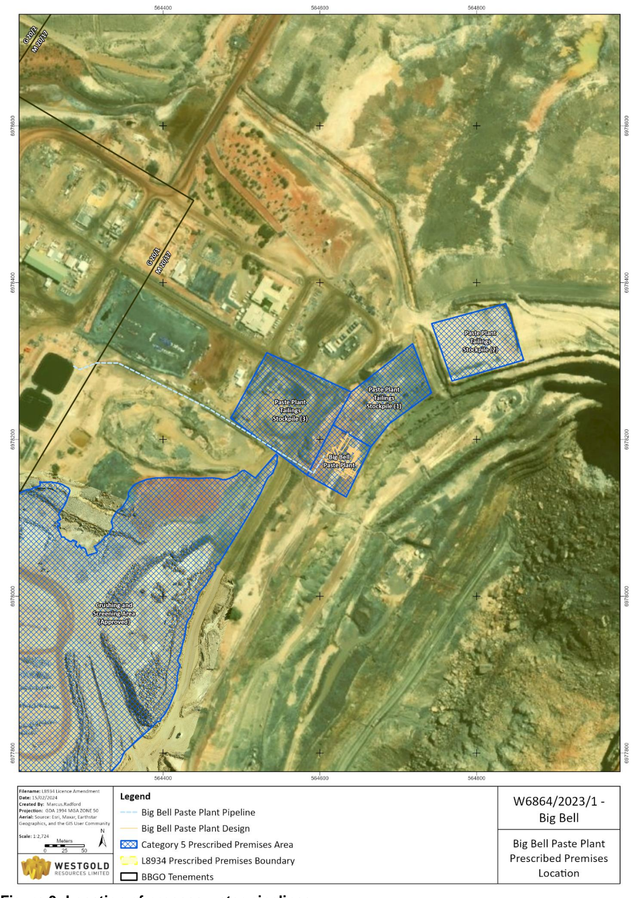
Figure 3: Location of process water pipelines