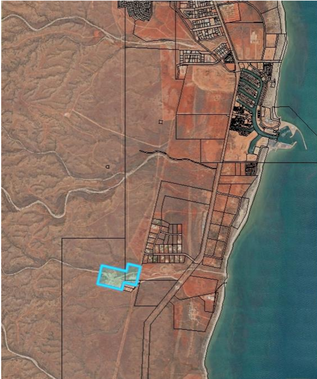
Figure 1: Premises boundary map

The boundary of the prescribed premises is shown in blue in the map below.