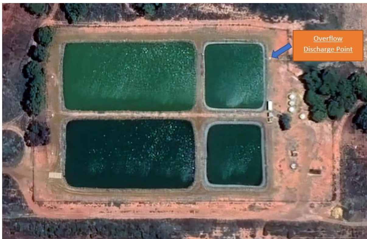
Figure 4: Location of treated wastewater overflow pipe.