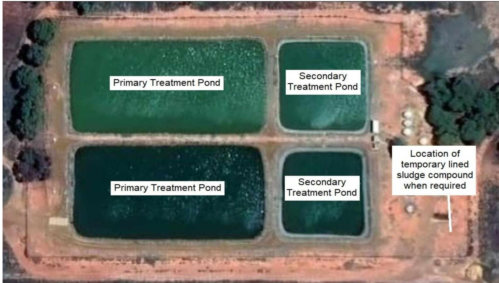
Figure 2: Location of premises infrastructure.