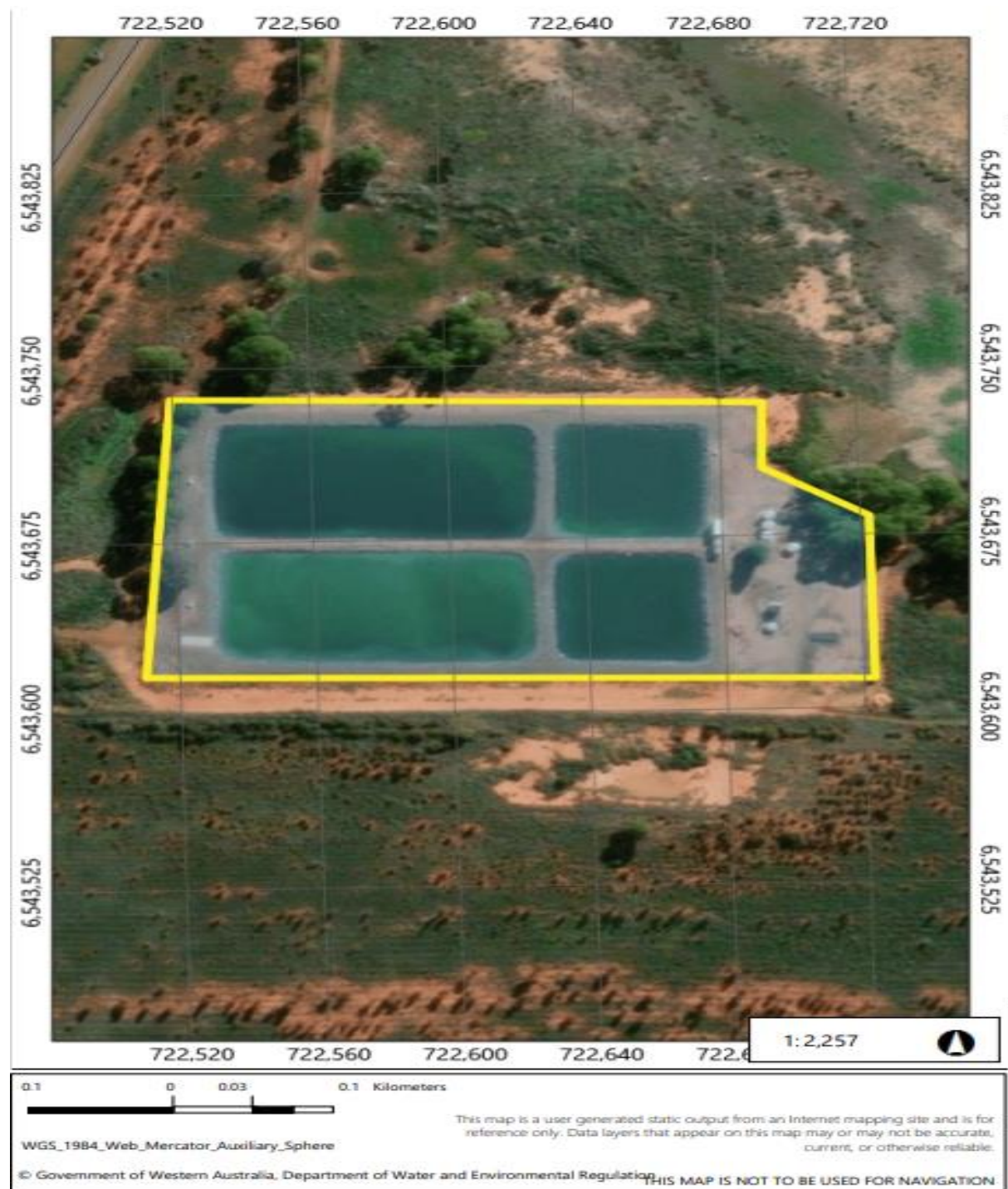
Figure 1: Map of the boundary of the prescribed premises.