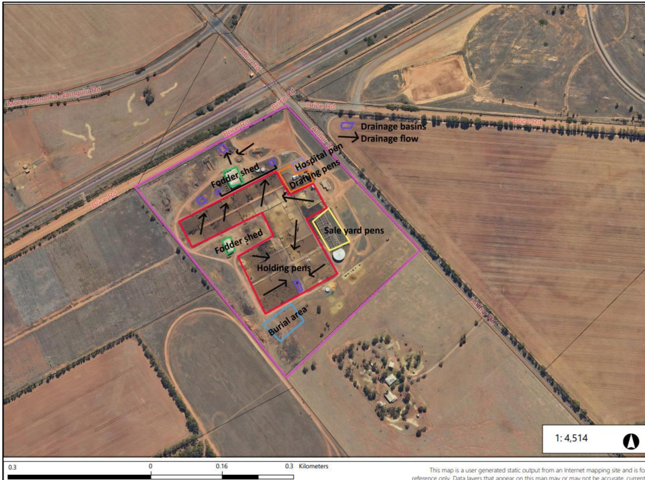
Figure 2: Map of the site layout of the prescribed premises

The site layout of the prescribed premises is shown in the map below (Figure 2)