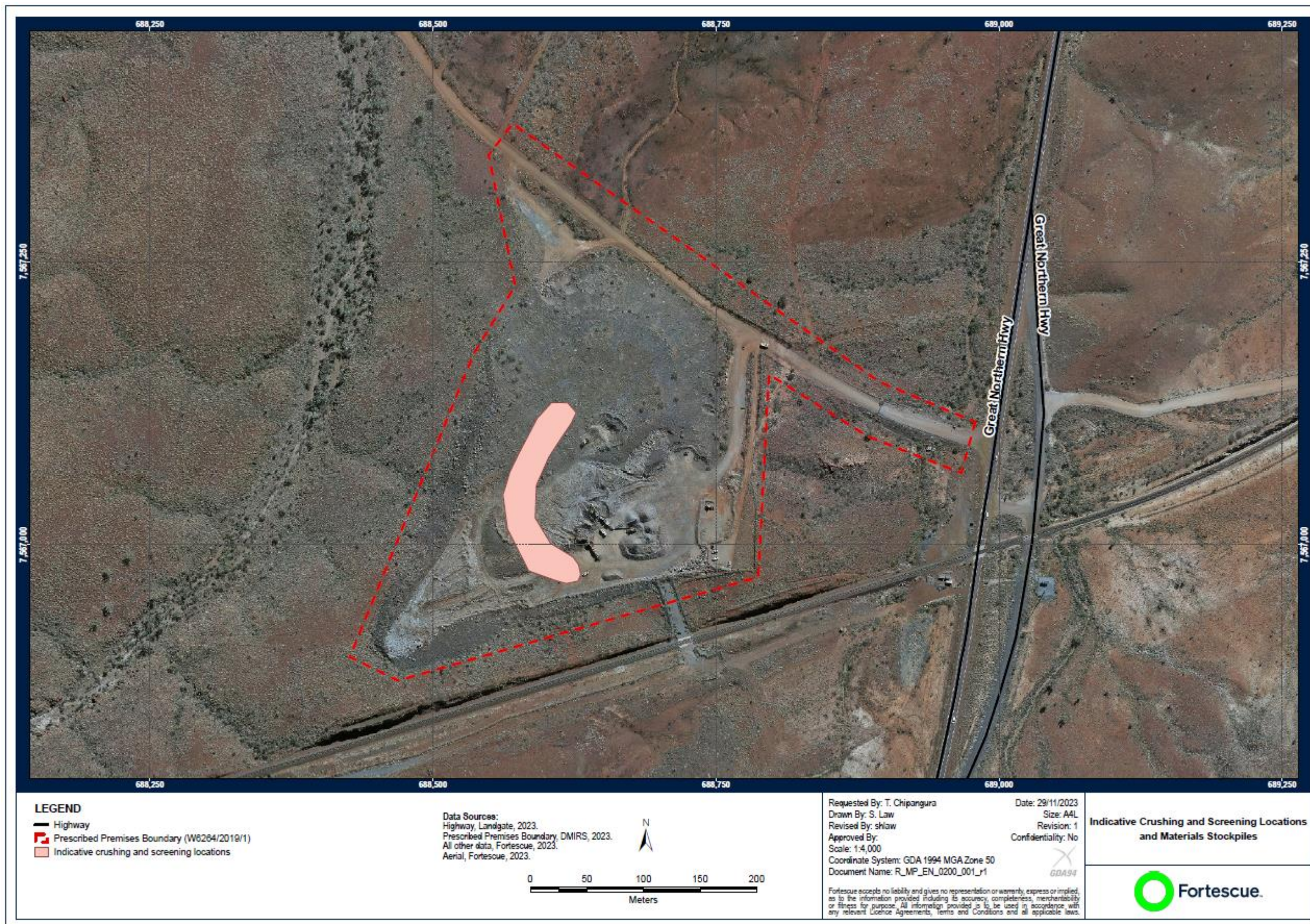
Figure 2: Indicative crushing and screening plant locations