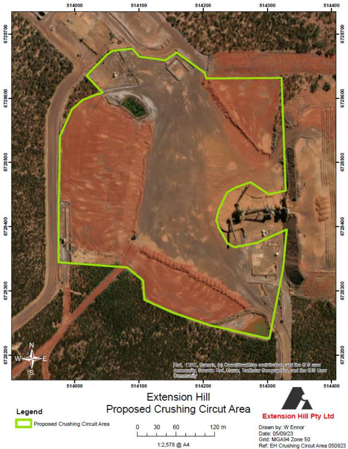
Figure 2: Extension Hill Crushing Circuit Area