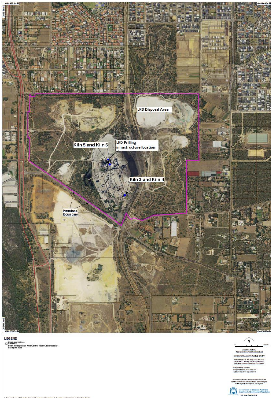
Figure 1: Premises boundary and location of infrastructure and LKD disposal area

The boundary of the prescribed premises is depicted by the pink line in the map below (Figure 1).