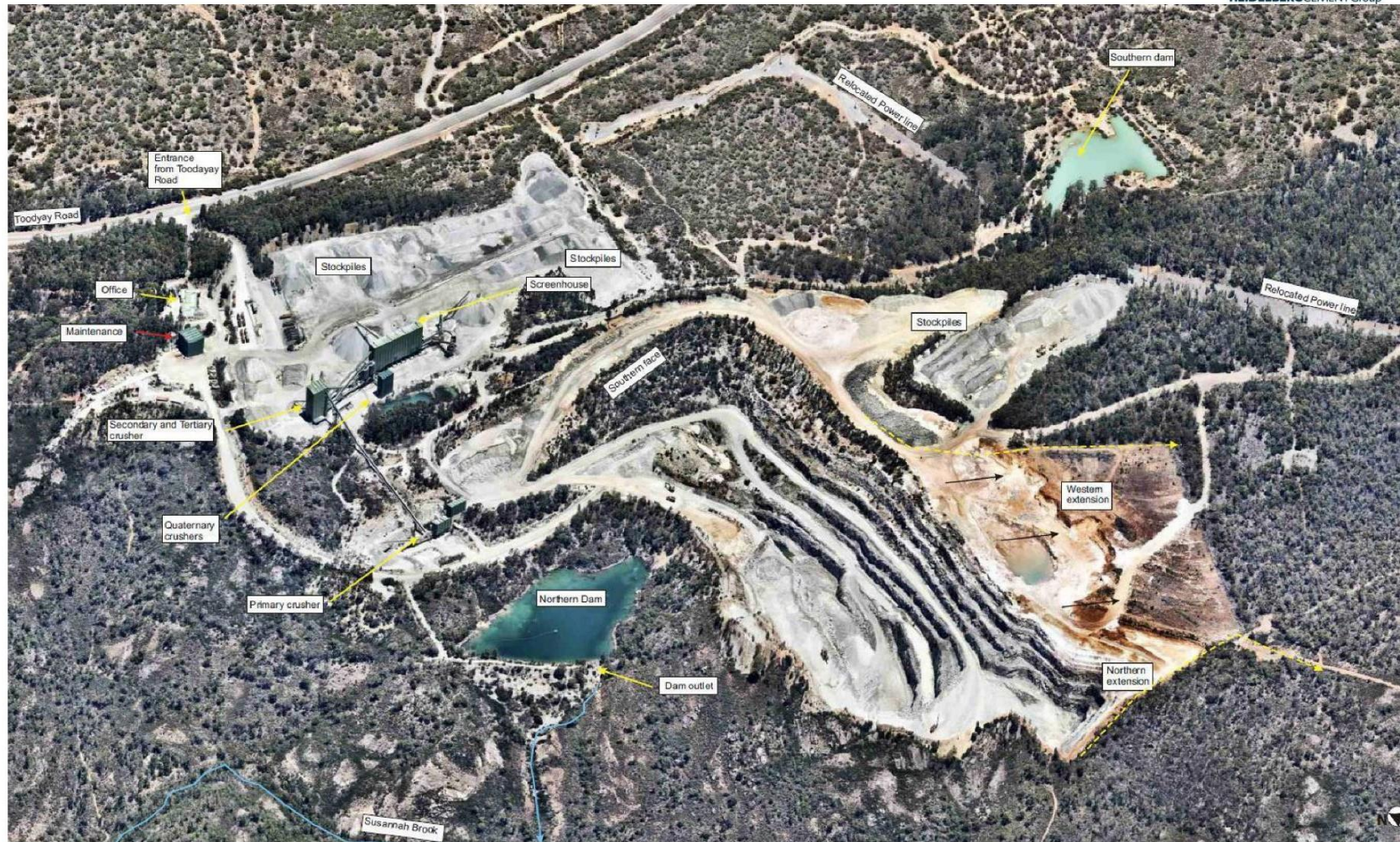
Figure 2: Red Hill Quarry – Prescribed Activities

W6797/2023/1 (date of works approval issue: 07 July 2023) IR-T05 Works approval template (v6.0) (September 2022)