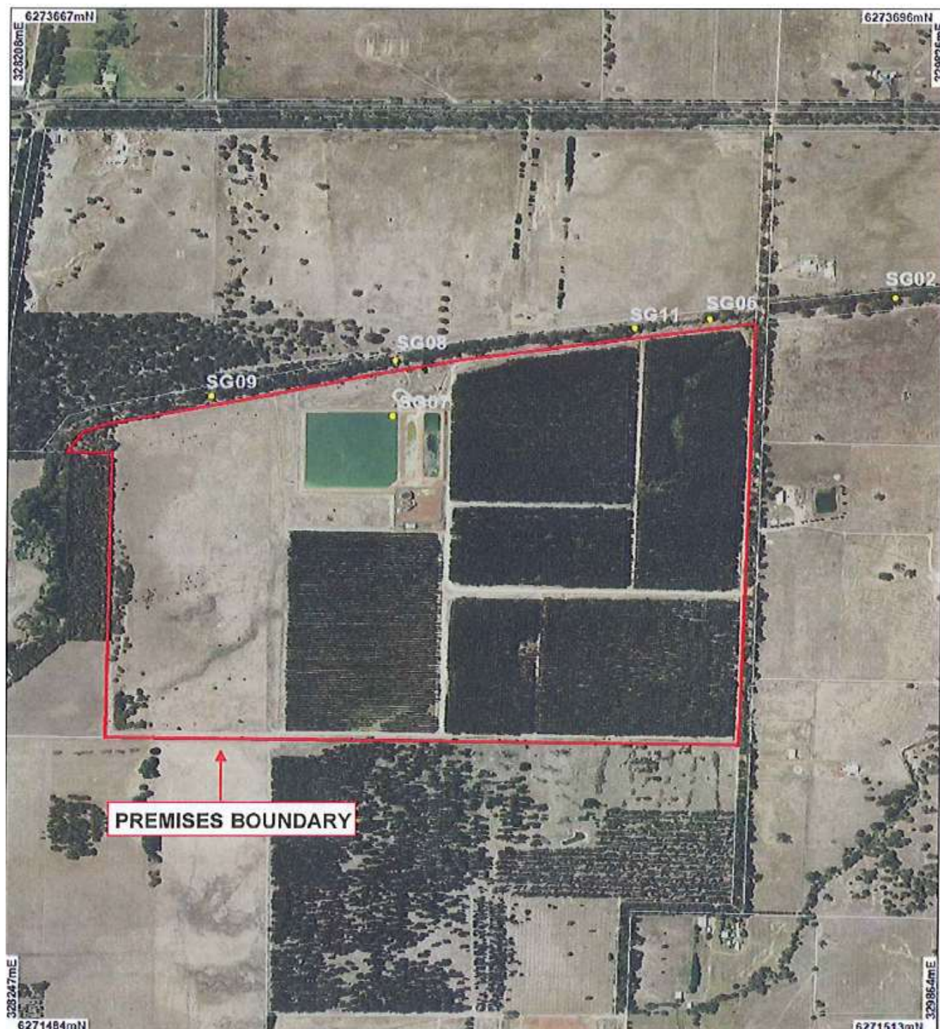
Figure 1: Map of the boundary of the prescribed premises and location of surface water monitoring points

The boundary of the prescribed premises is shown in the map below (Figure 1).