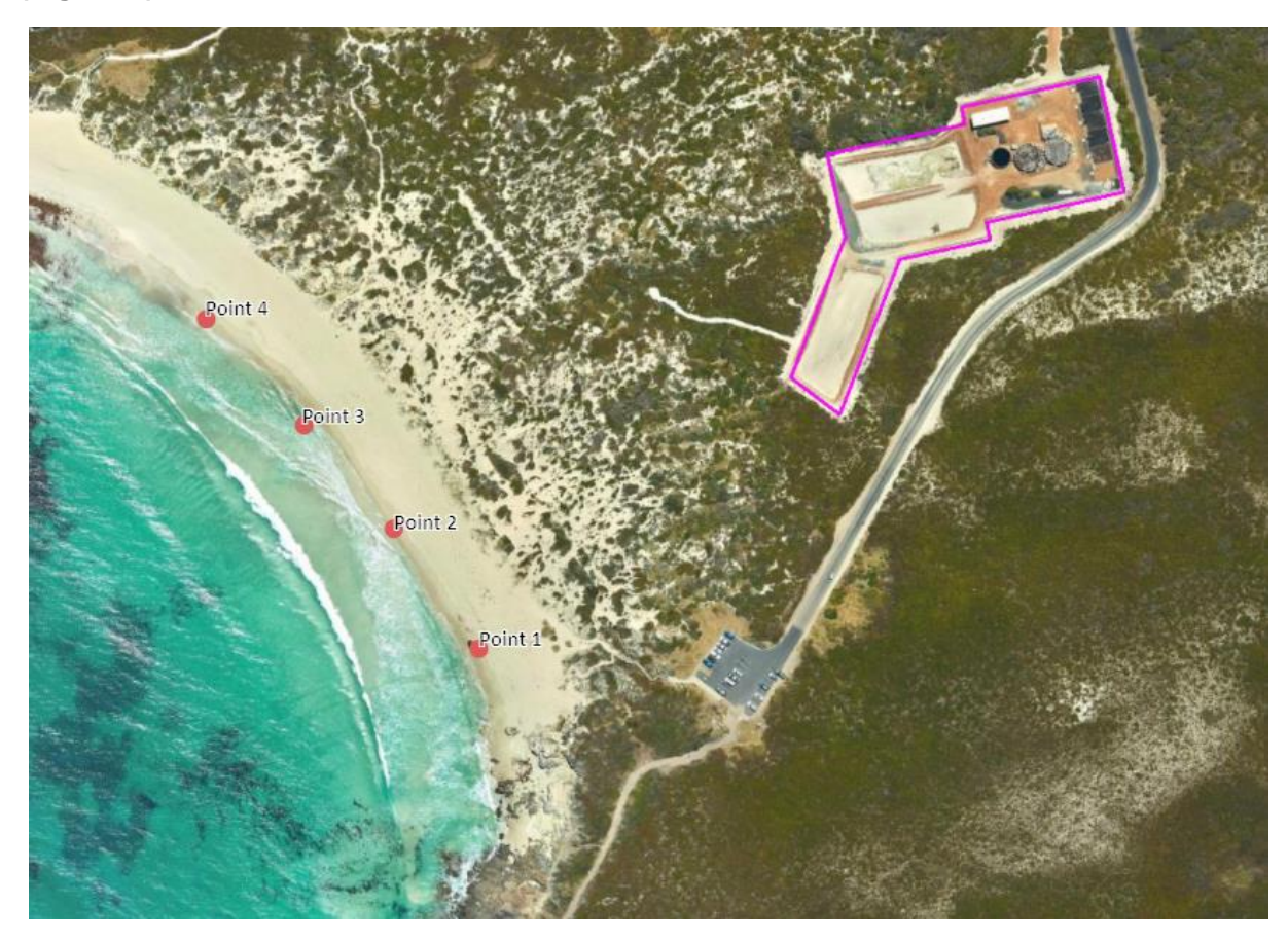
Figure 2: Shore sample points

The location of shore sample points is shown by the red circles in the map below (Figure 2).