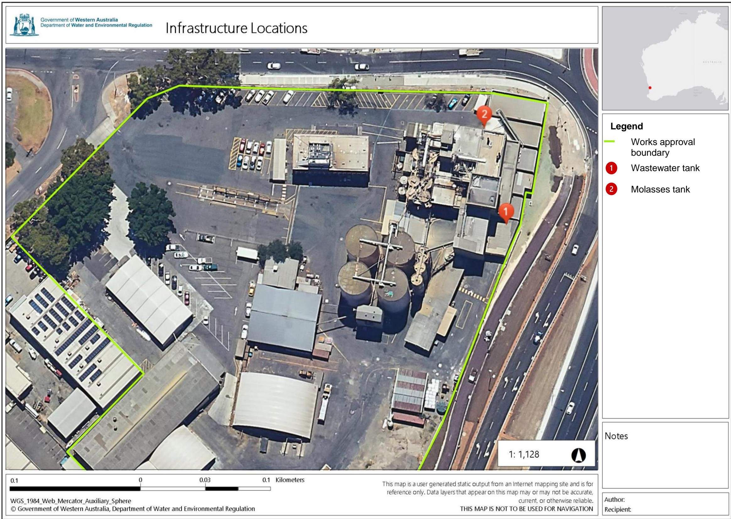
Figure 2: Map of infrastructure locations