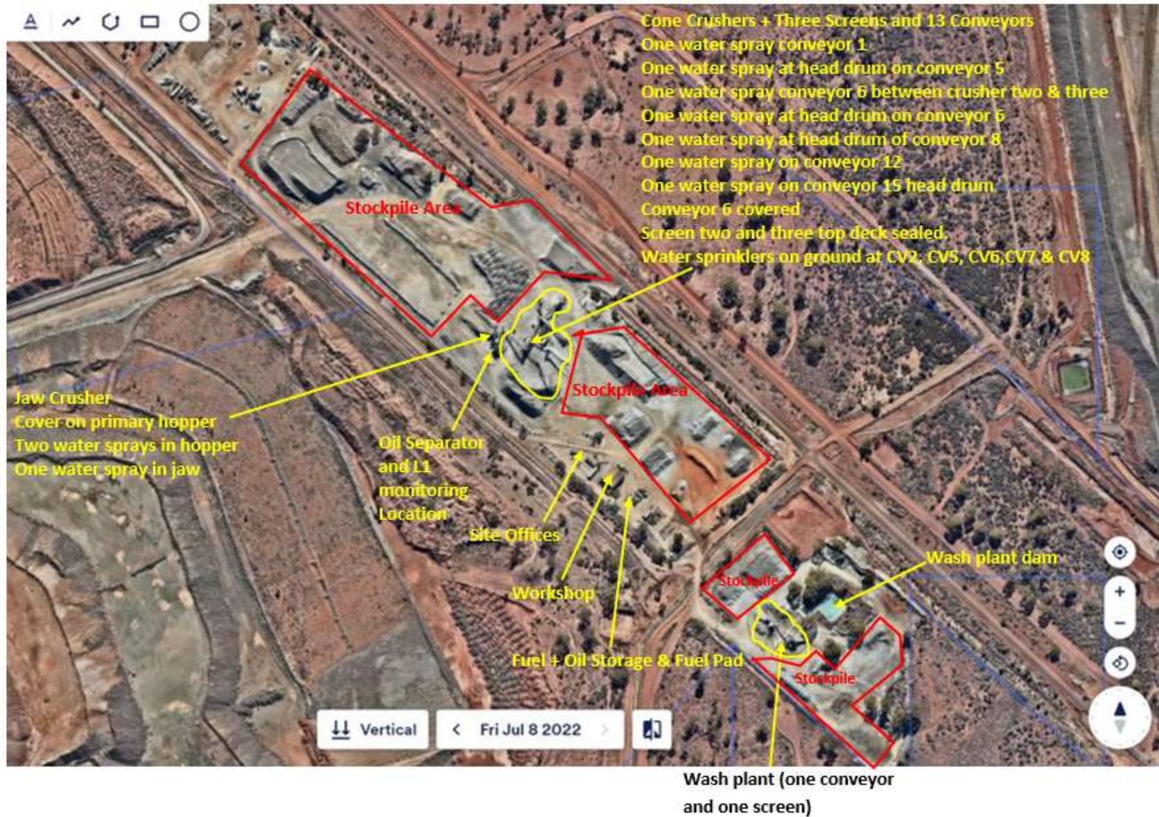
Figure 3: Location of infrastructure