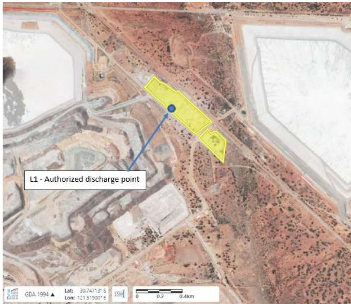
Figure 2: Authorized Discharge Point - L1