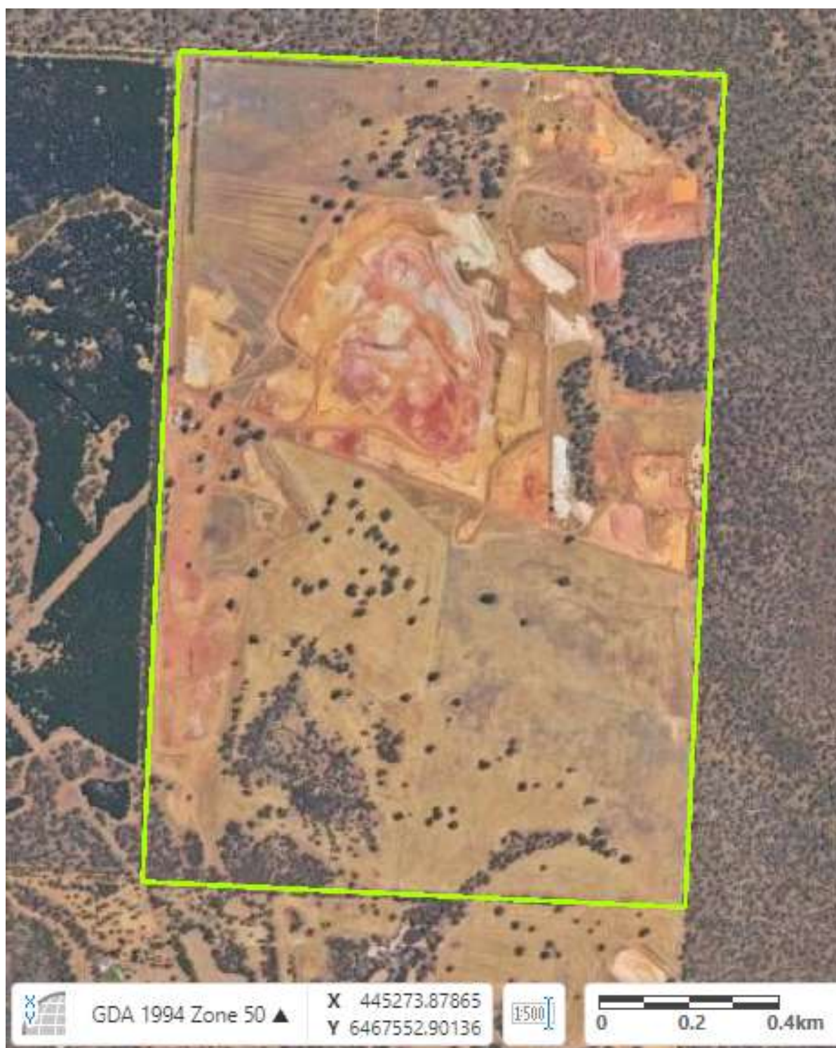
Figure 1: Map of the boundary of the prescribed premises shown in green.

The boundary of the prescribed premises is shown in the map below (Figure 1).