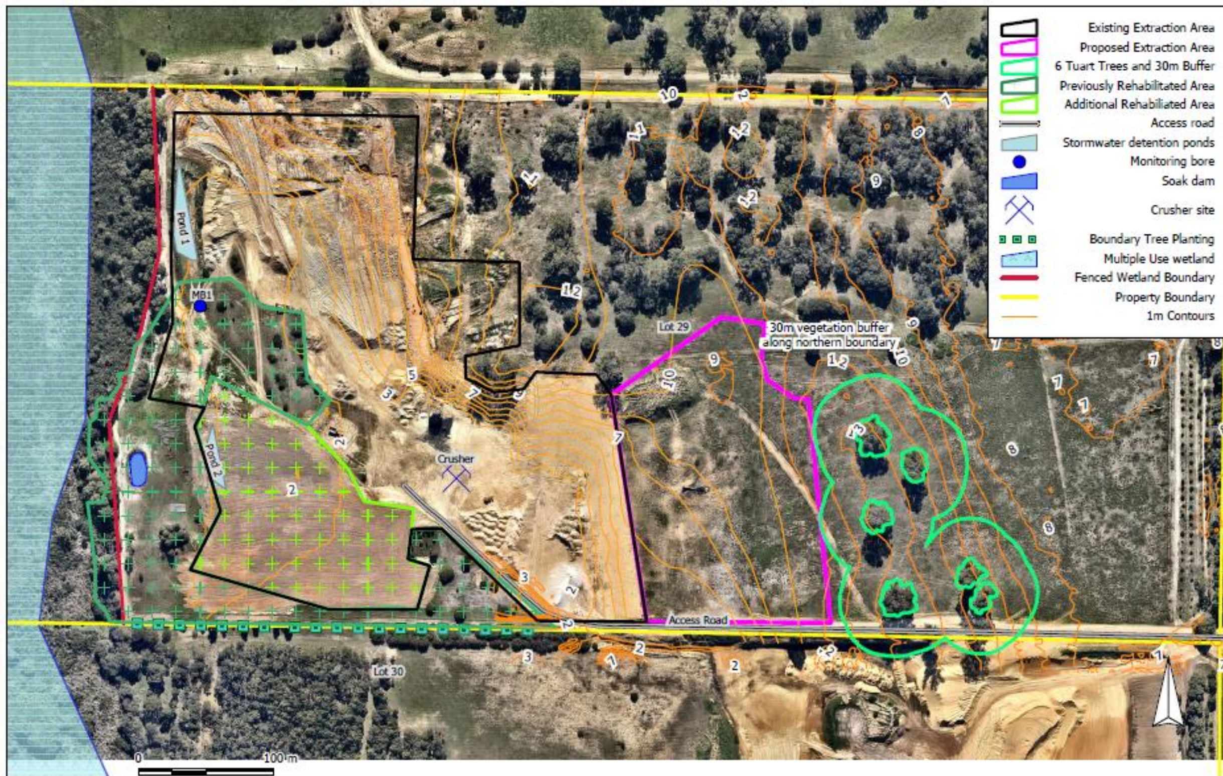
Figure 2: Site layout and position of the crusher.