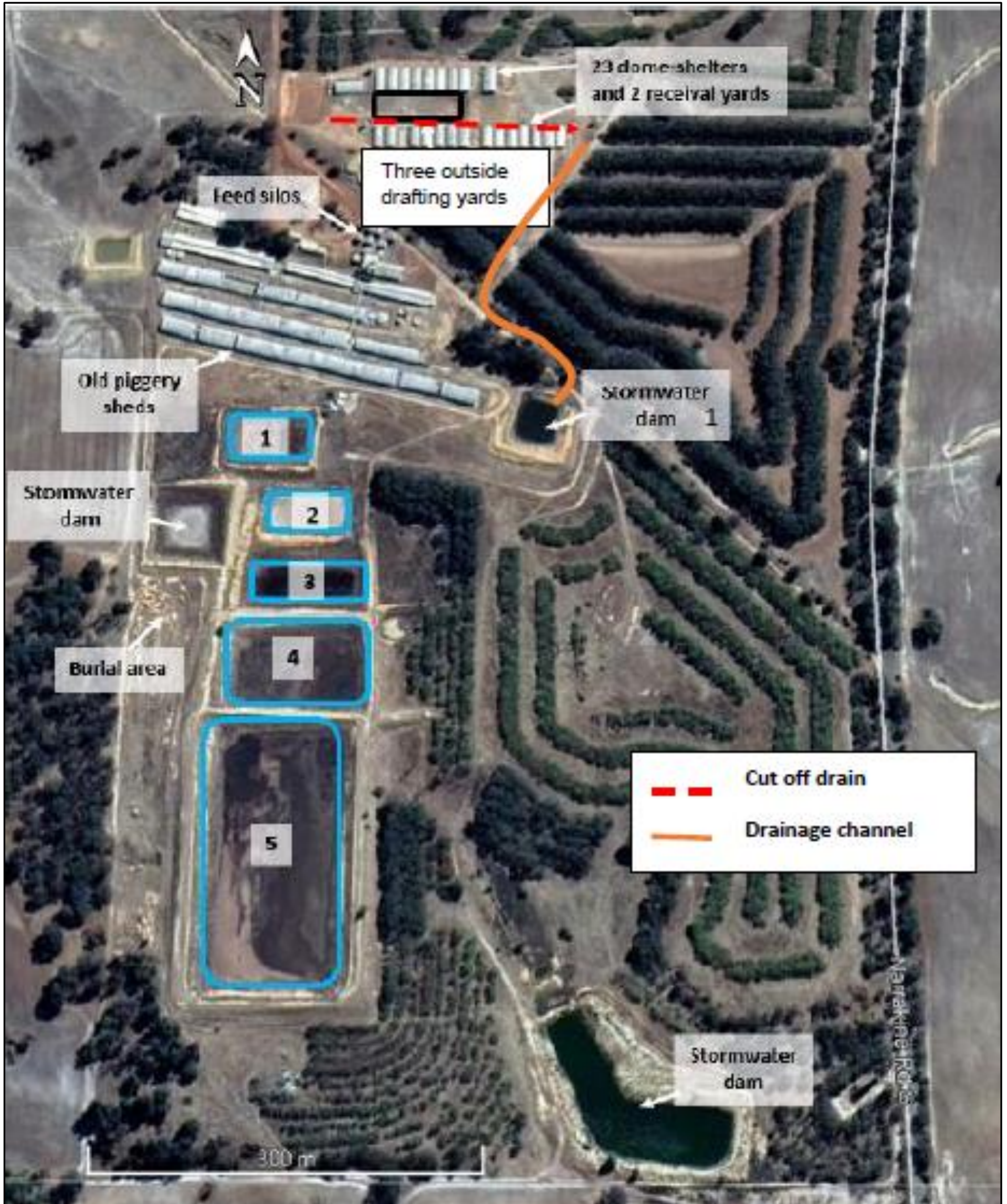
Figure 3: Outlines the infrastructure within the prescribed premises.

The infrastructure of the prescribed premises is shown in the map below (Figure 3).