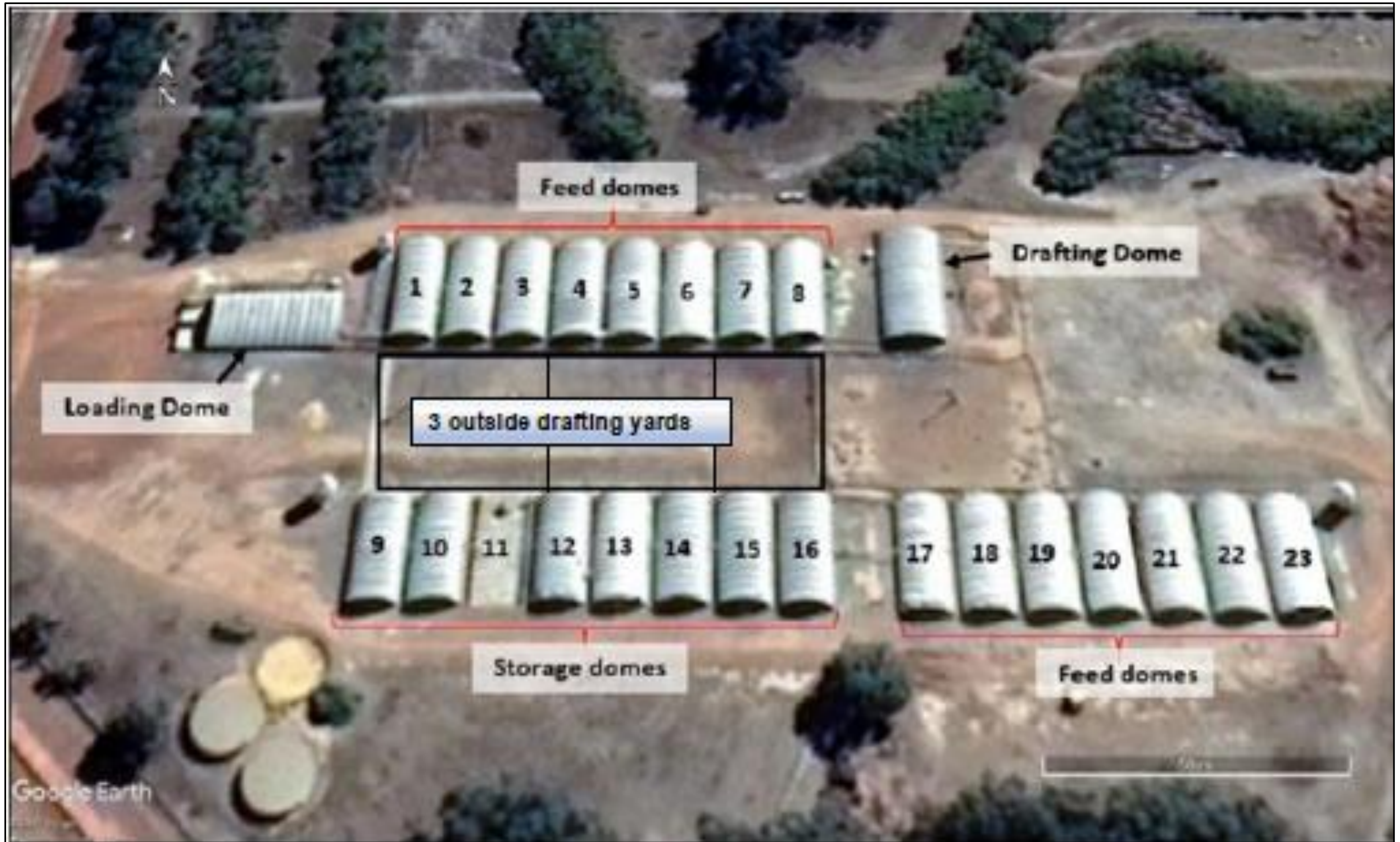
Figure 2: Outlines the three outside holding yards, the feed shelters, loading shelter and drafting shelter.

The dome shelters of the prescribed premises are shown in the map below (Figure 2).