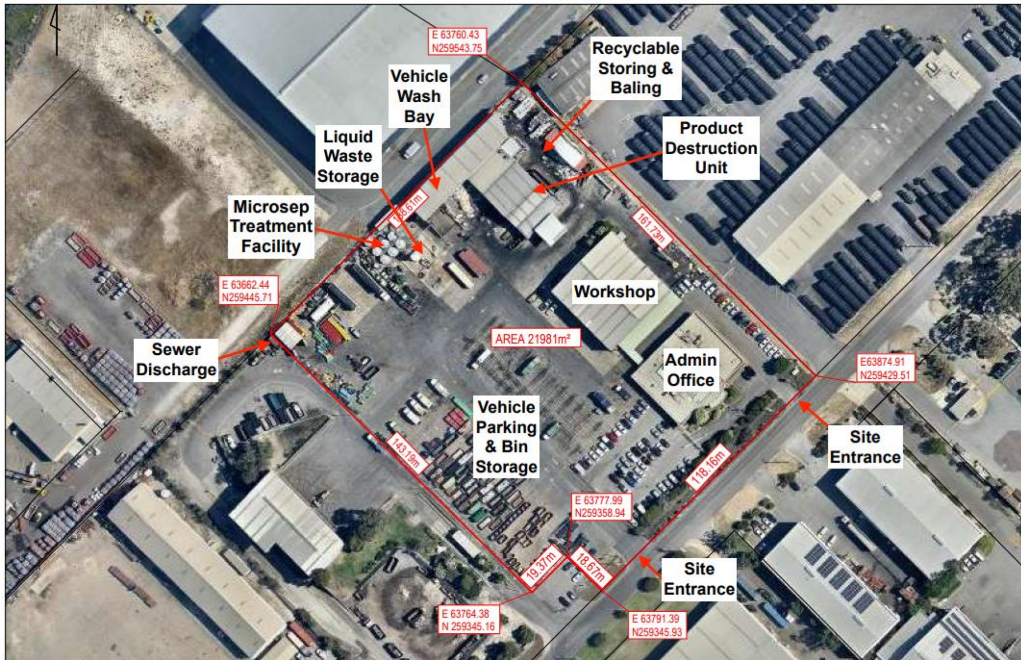
Figure 1: Map of the boundary of the prescribed premises

The boundary of the prescribed premises is shown in the map below (Figure 1).