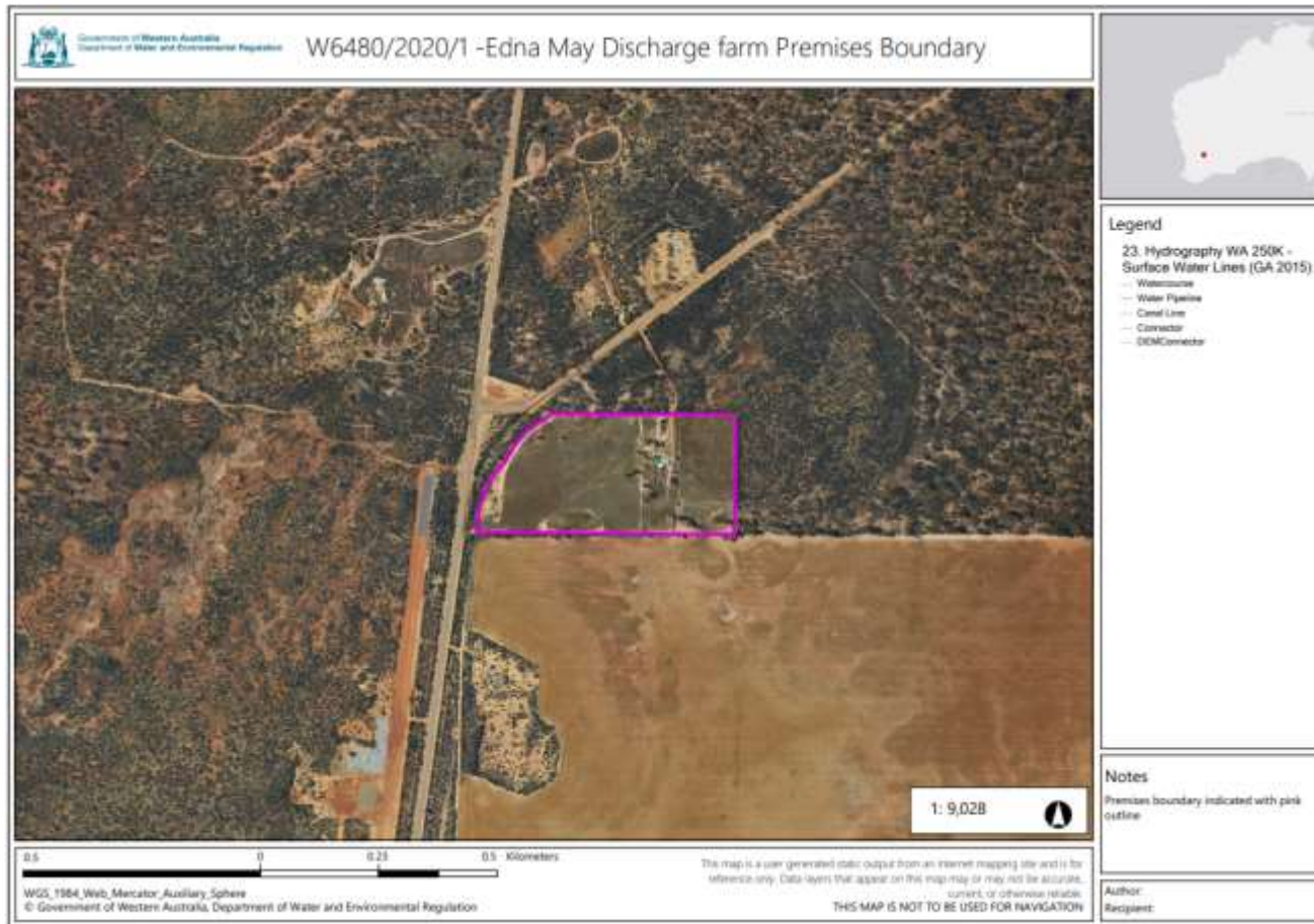
Figure 1: Map of the boundary of the prescribed premises

The boundary of the prescribed premises is shown in blue in the map below (Figure 1).