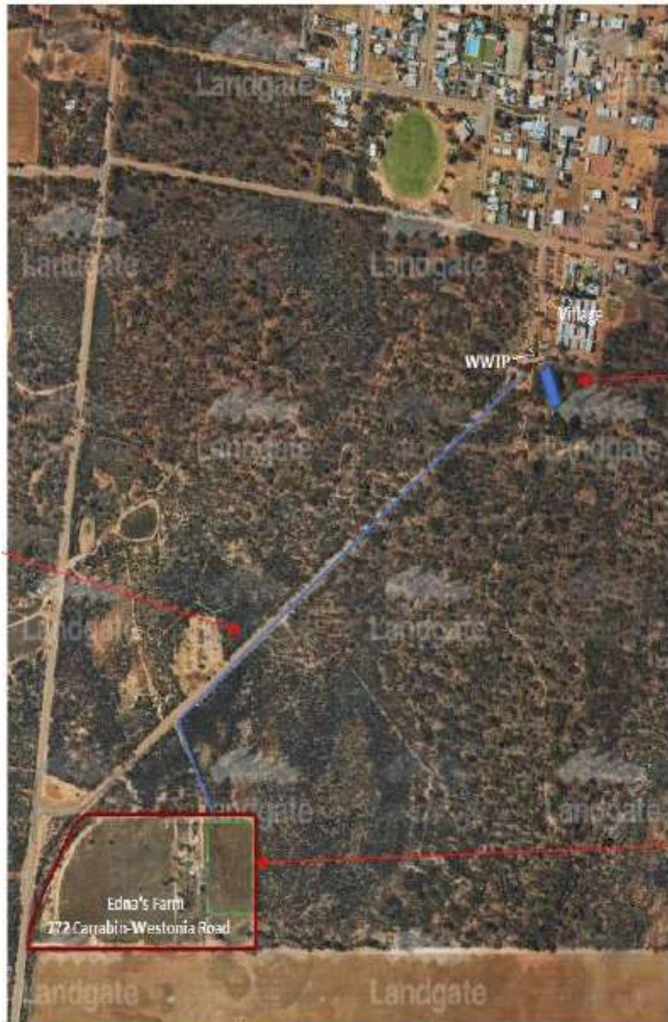
Figure 2: Map showing wastewater treatment plant and irrigation area location in green