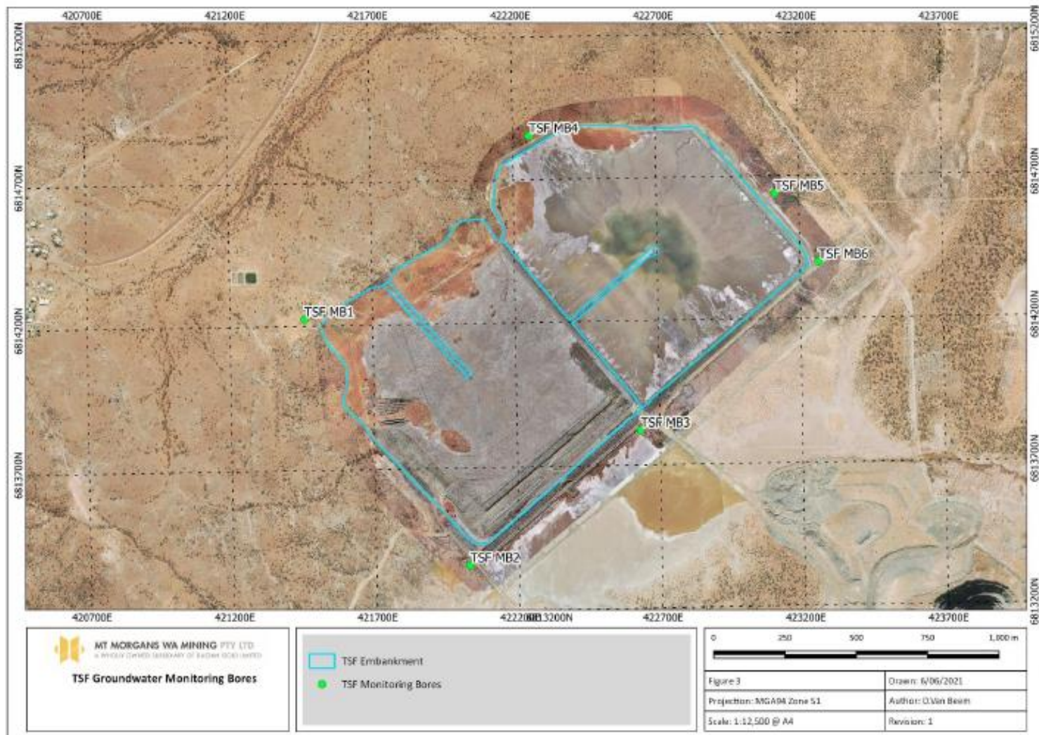
Figure 2: TSF monitoring bores